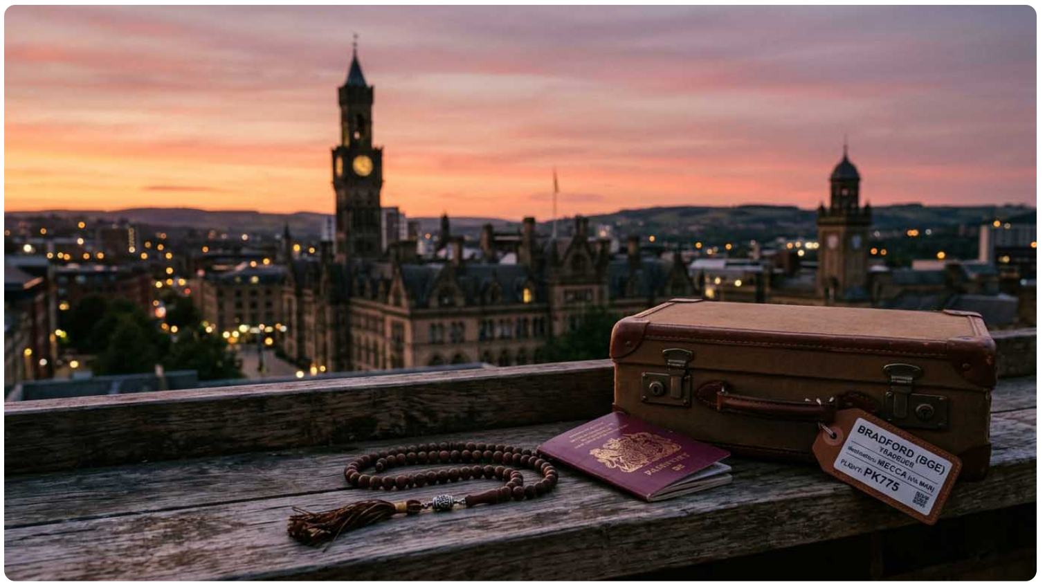
Umrah packages from Bradford 2026 with Bradford skyline and travel items