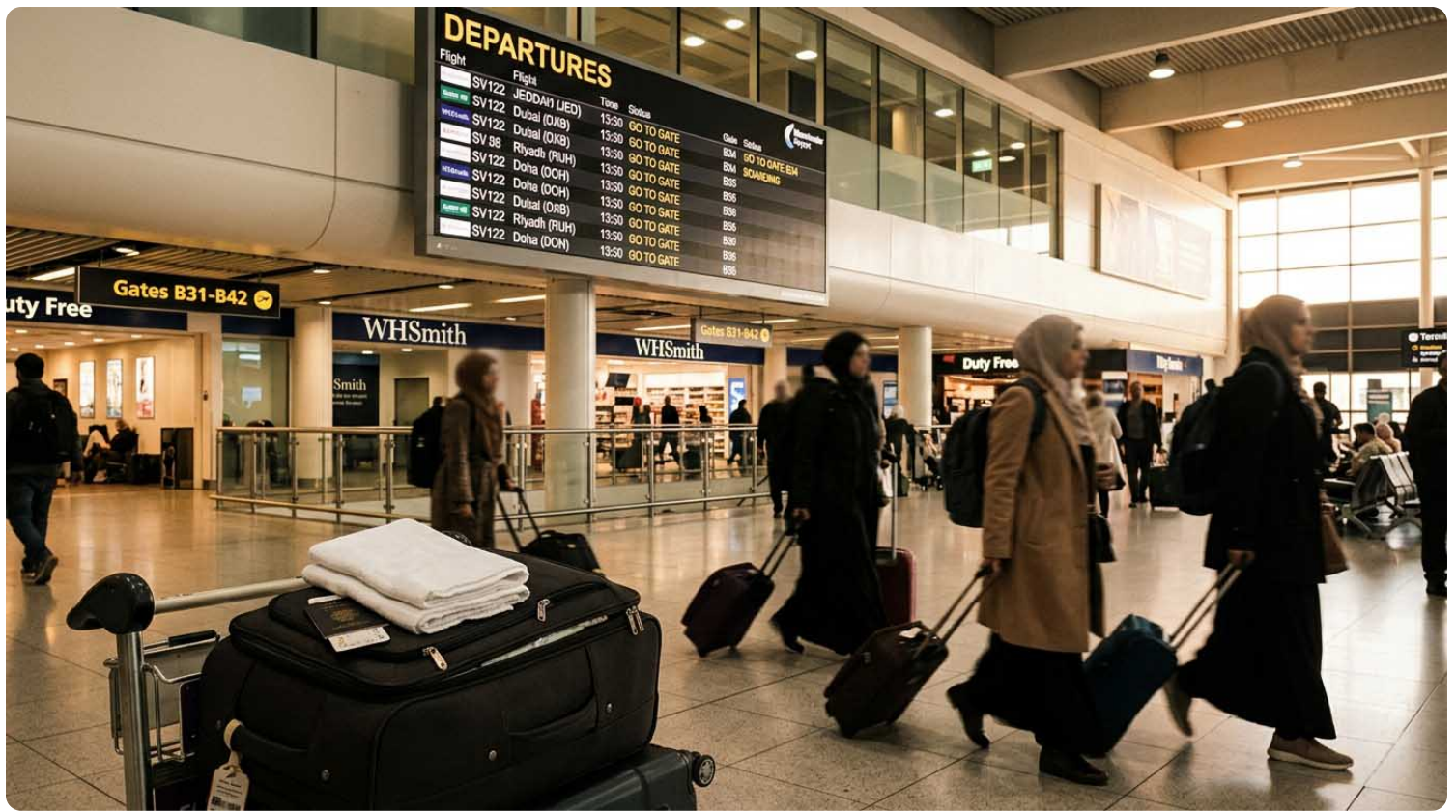
Manchester Airport Umrah flights from Bradford to Jeddah at Terminal 2 departures