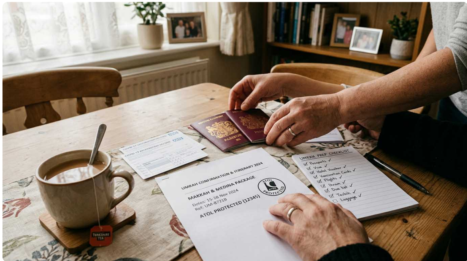
Bradford family preparing documents for ATOL protected Umrah package from Bradford 2026

Yes, we do. We offer both Hajj and Umrah options for Bradford travellers, including shifting and non-shifting choices. If you're planning ahead, see our Hajj packages 2026 page. Places are limited, so early planning helps.