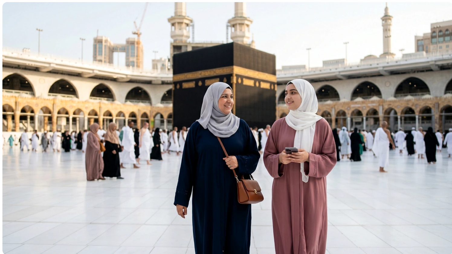
Ramadan Umrah Packages UK Price Tiers Budget to Luxury