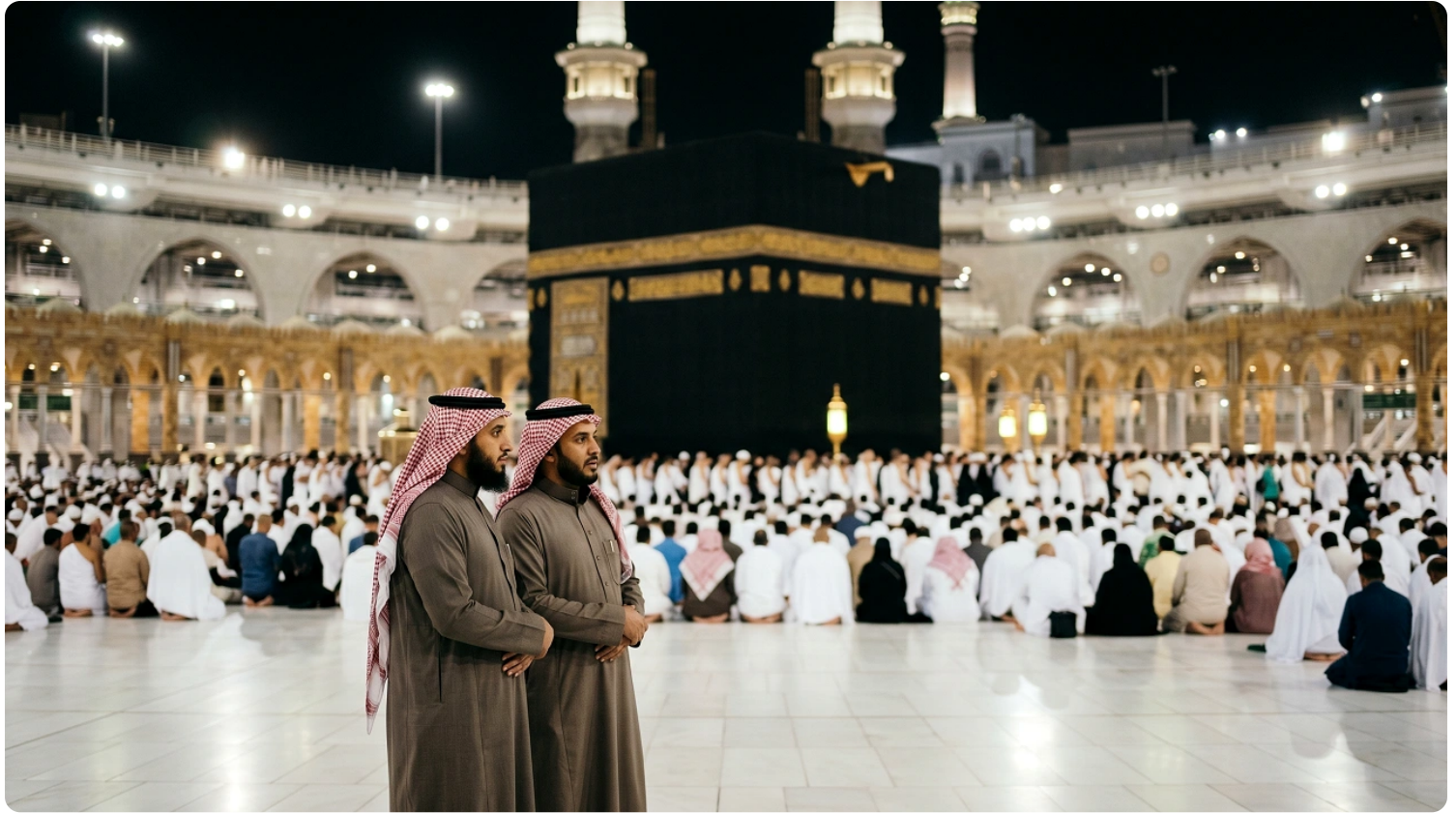
Ramadan Umrah Packages Masjid Al Haram Night Worship

If you'd like help with the worship side too, our guide on how to perform Umrah is a good place to start before you book.