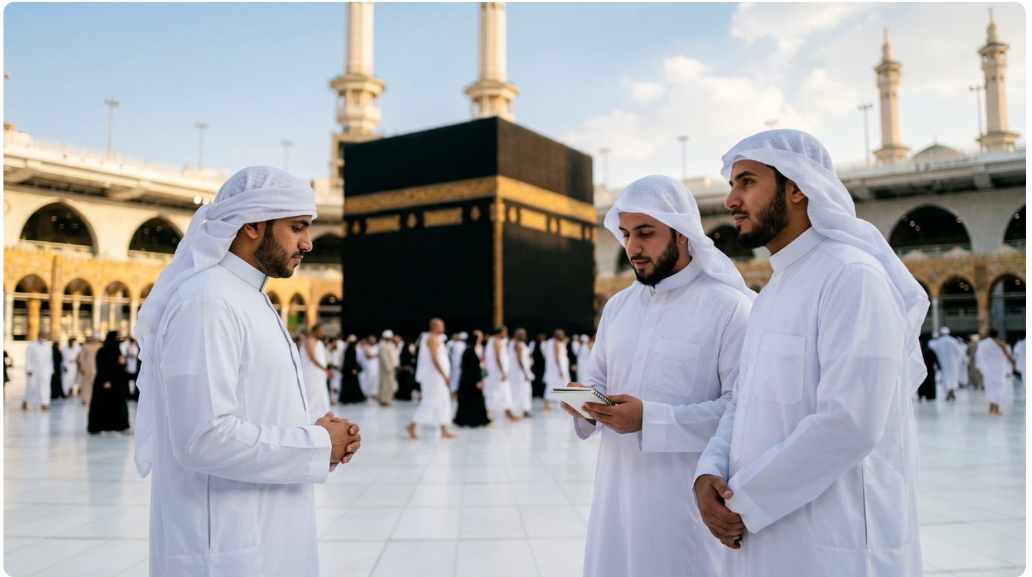
Ramadan First Two Weeks Vs Last Ten Nights Comparison

We've had pilgrims tell us they barely slept, yet felt more spiritually awake than any other time in their life. That's a very Ramadan-in-Makkah sentence, but it's true.