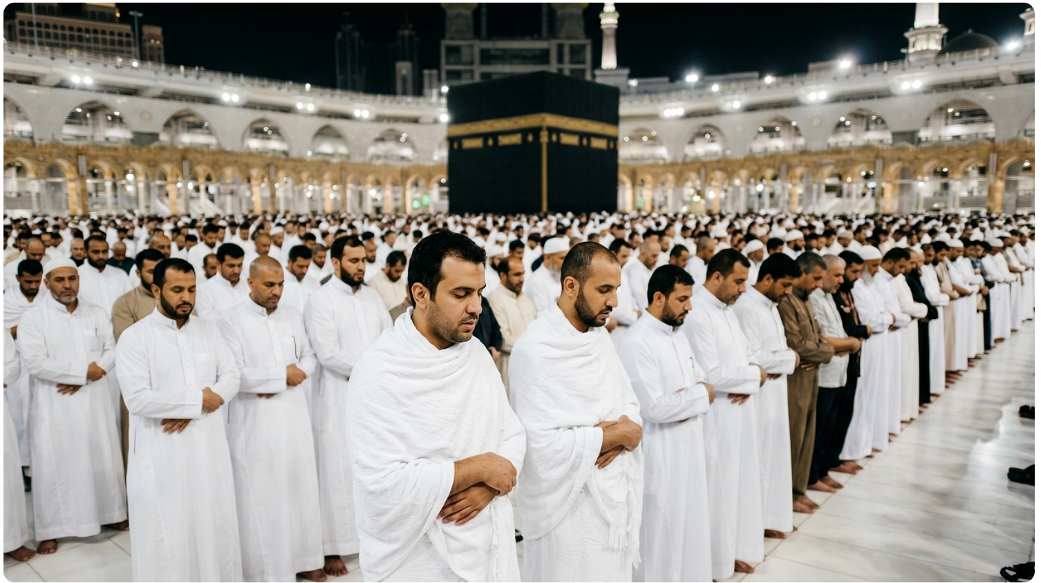
Taraweeh Prayer Haram Makkah Ramadan Crowds

Still, the crowd isn't only a hardship. It's also part of the beauty. Millions of Muslims. One direction. One fast. One House. It does something to you.