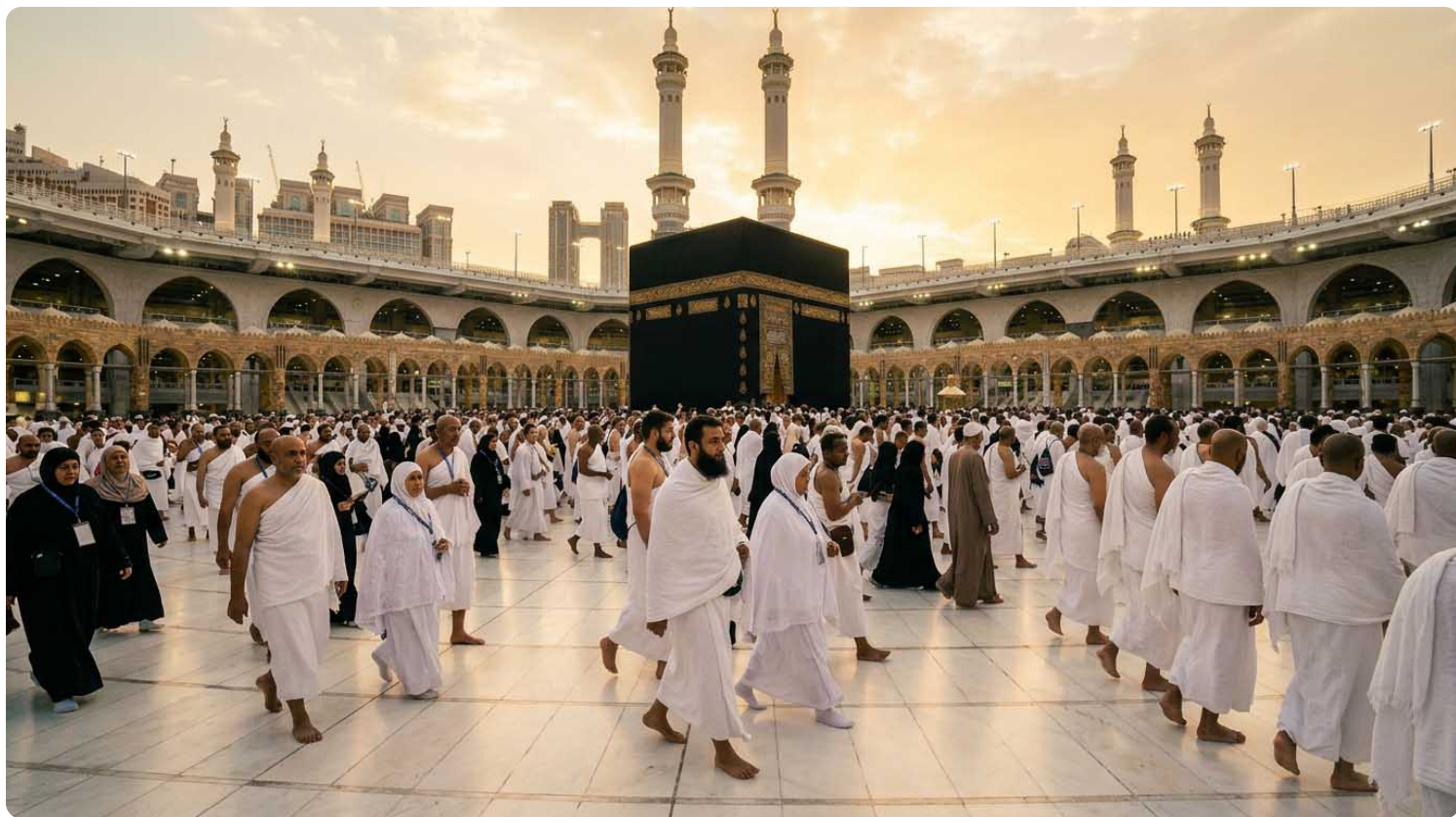
complete umrah dua list 2026 pilgrims performing tawaf around kaaba