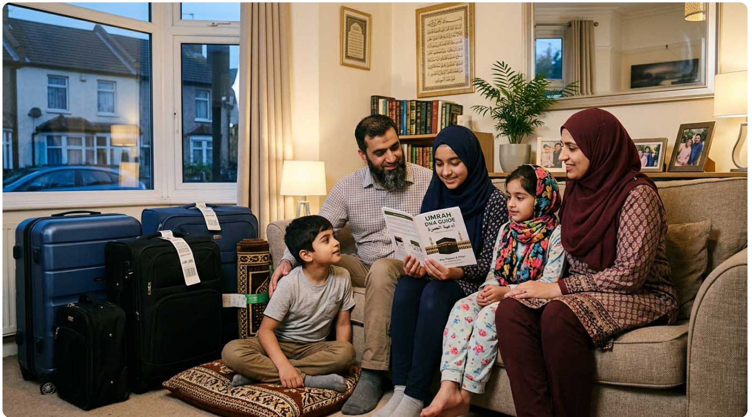
uk muslim family reading umrah dua list together before departure