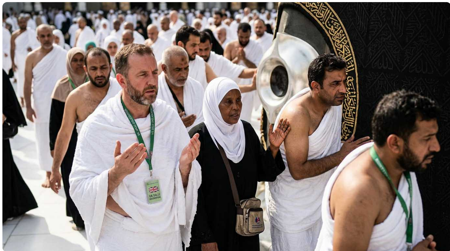
dua for tawaf during umrah pilgrims circling kaaba