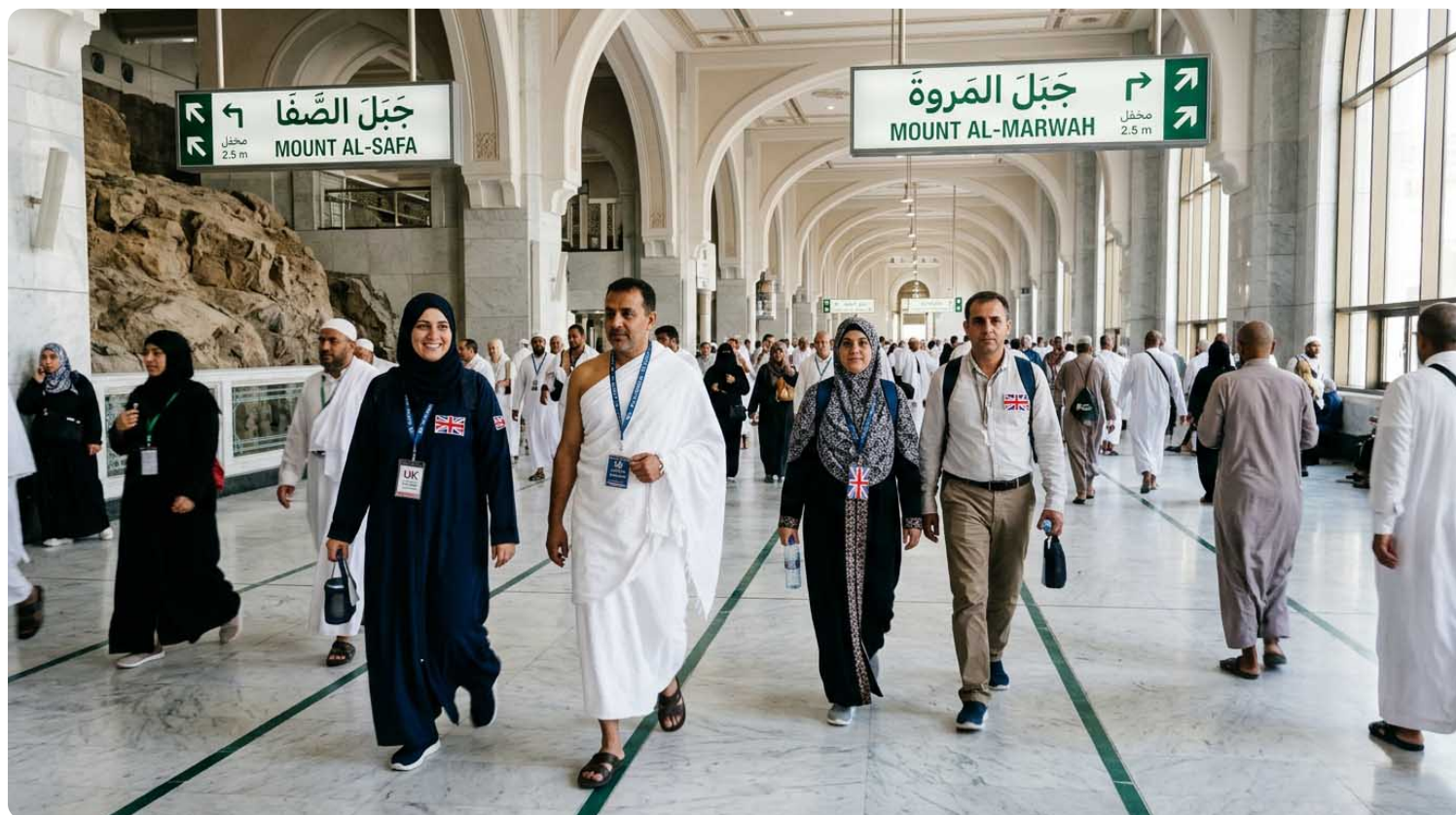
dua for sai between safa and marwah umrah corridor