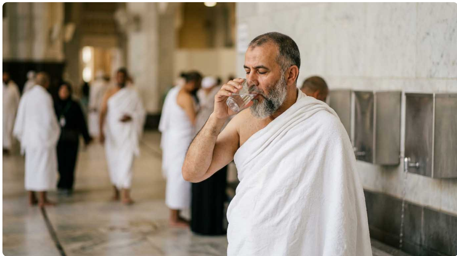
dua for drinking zamzam water during umrah pilgrimage