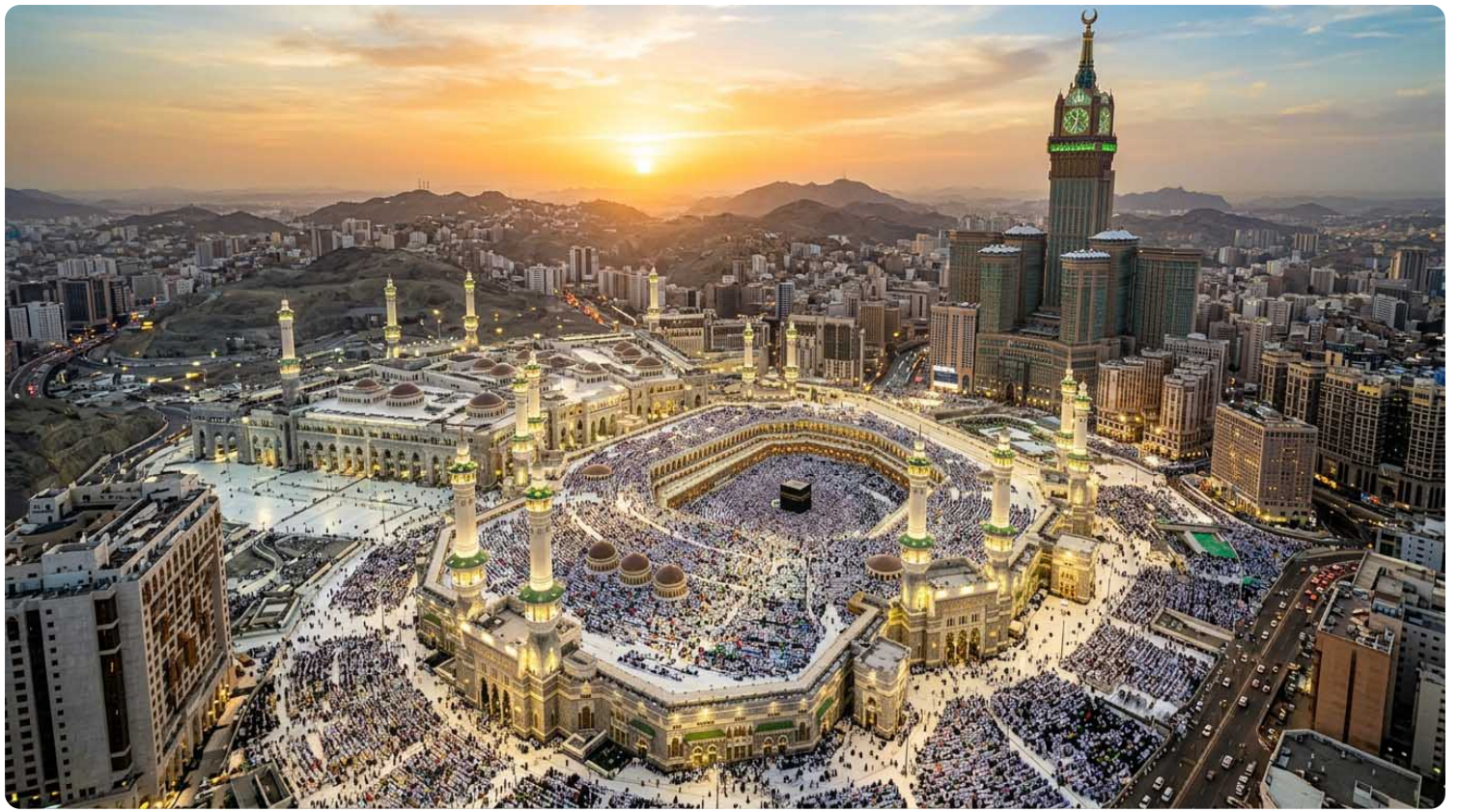
places to visit in makkah aerial view masjid al haram kaaba 2026