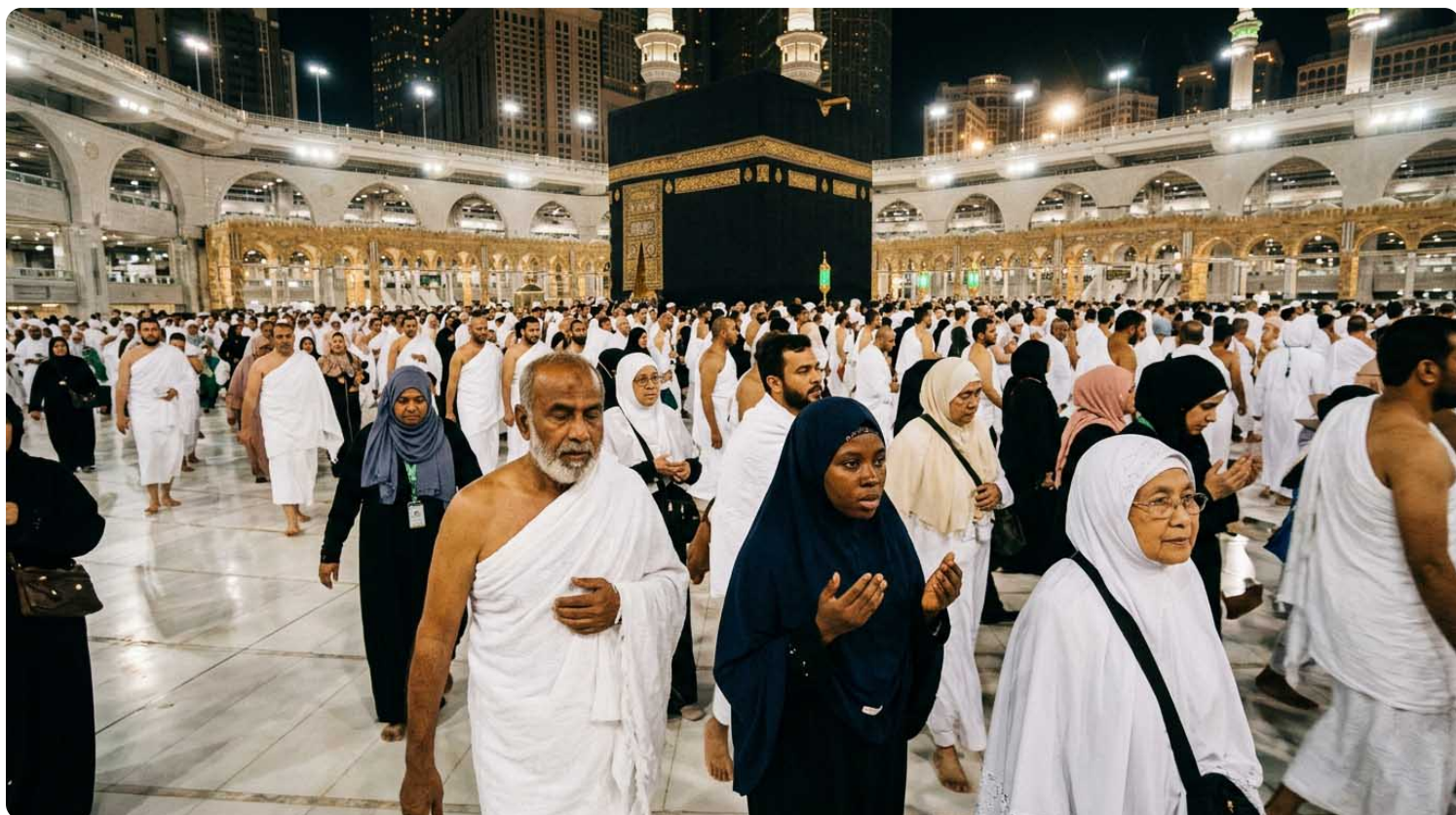
masjid al haram kaaba pilgrims performing tawaf makkah

Want to make your tawaf truly special? See our tawaf dua guide for the exact supplications and etiquette. And for Sa'i, check our Safa and Marwa dua guide .