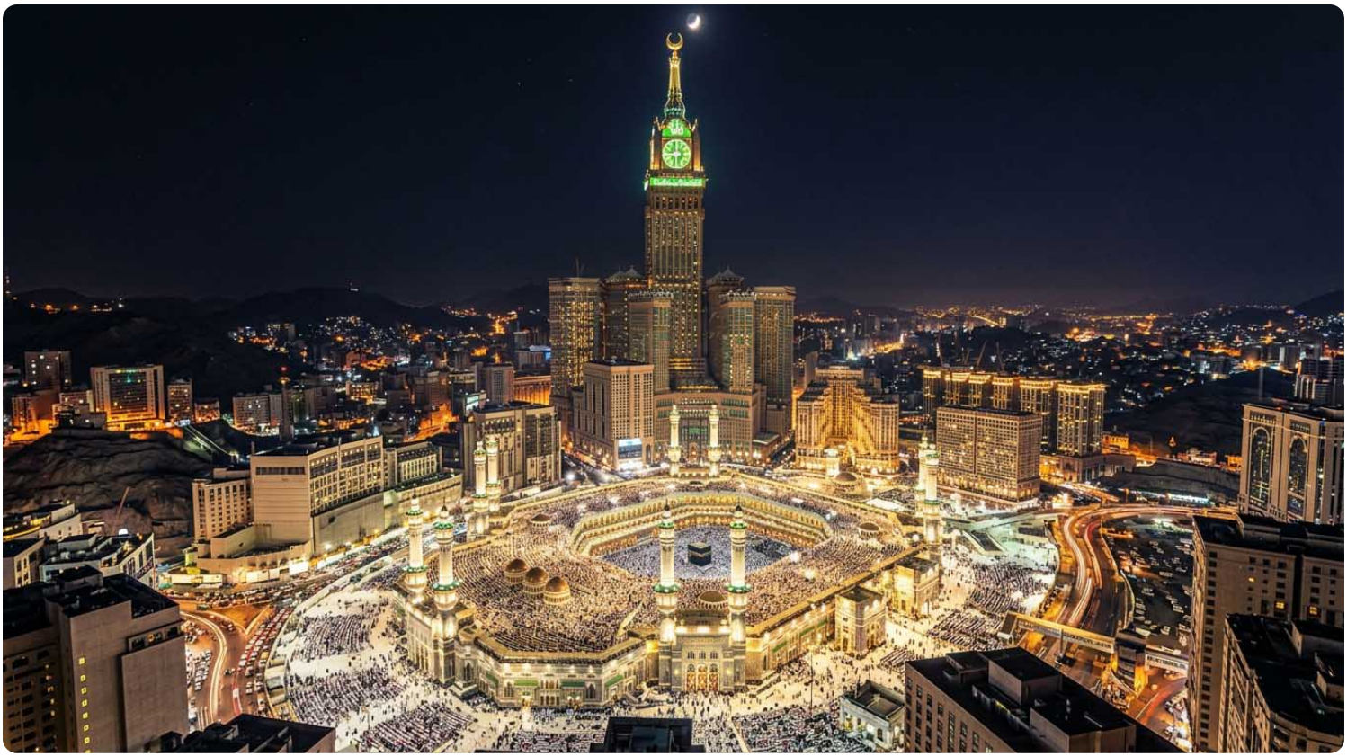
makkah clock tower abraj al bait modern attraction near masjid al haram