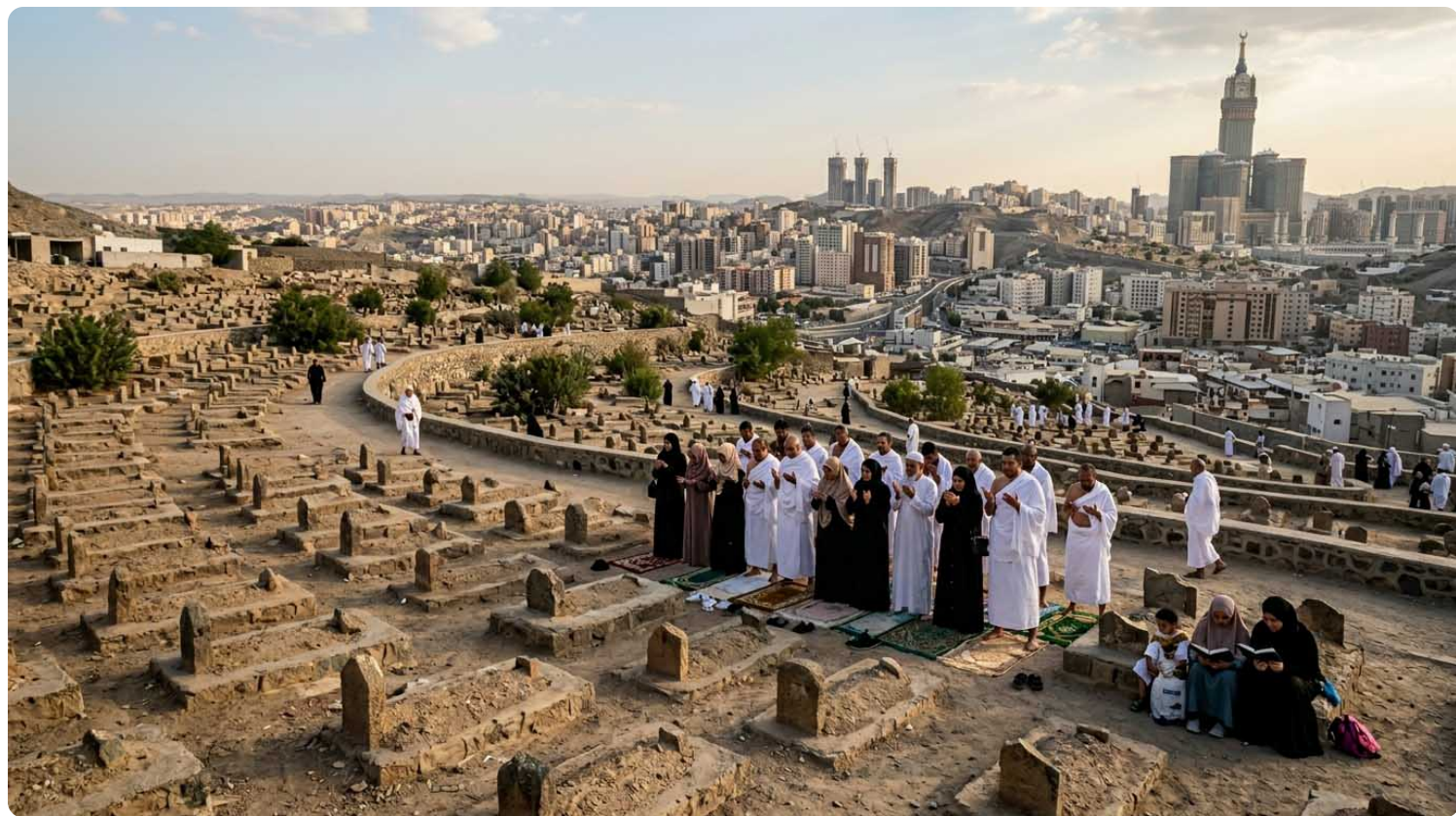
jannat al mualla cemetery makkah resting place of khadijah ra