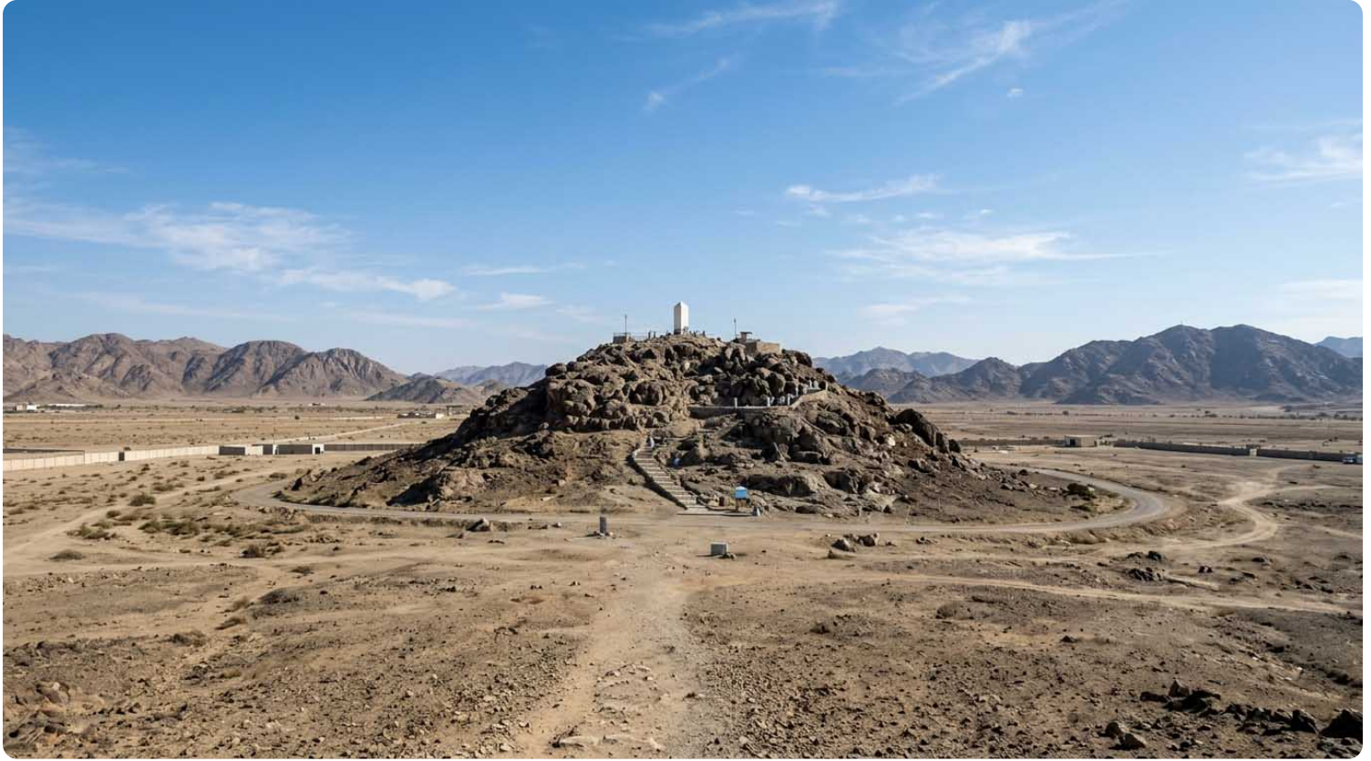
plain of arafat makkah where hajj reaches its climax jabal ar rahmah