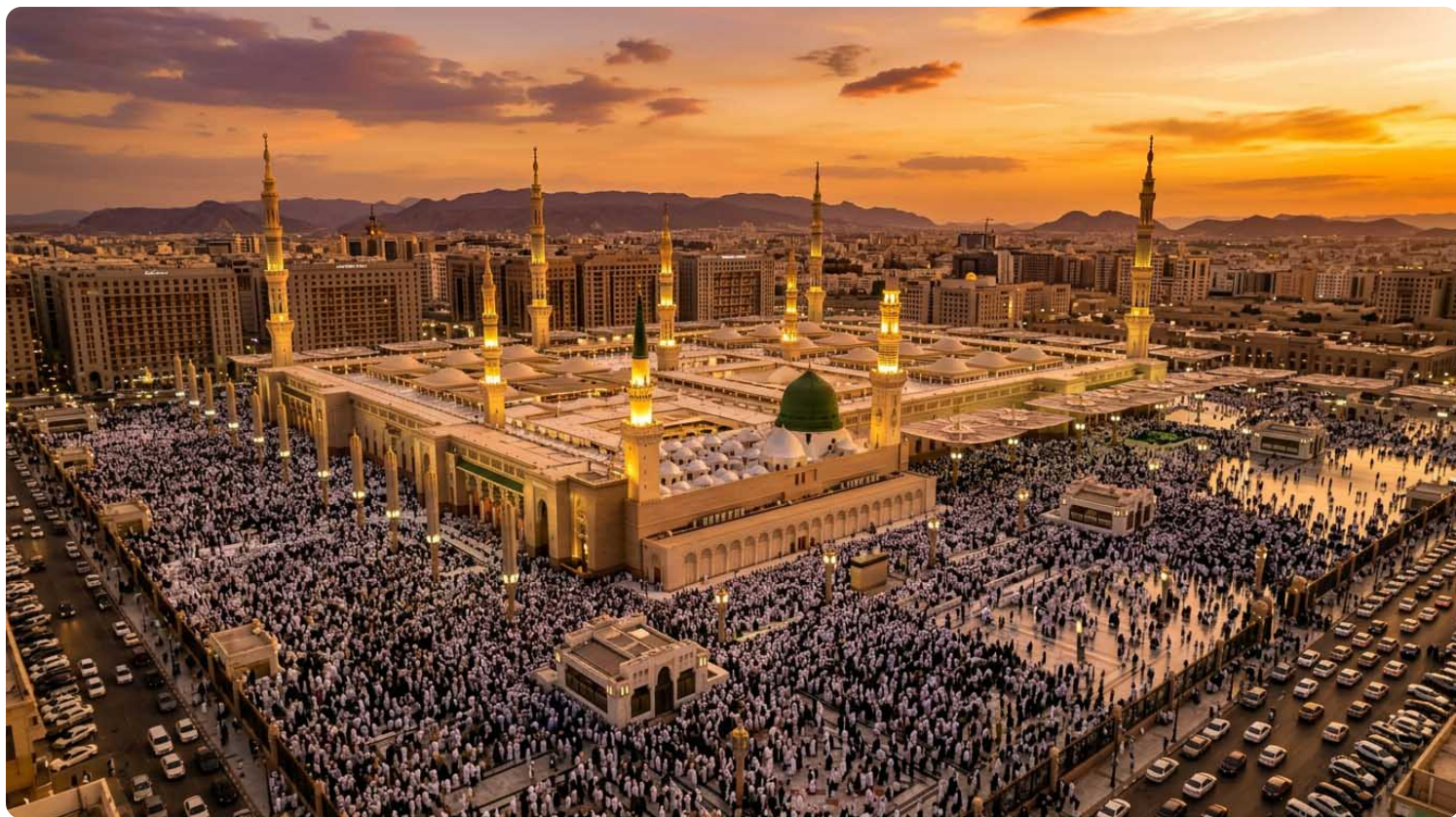
places to visit in madinah aerial view masjid nabawi green dome 2026