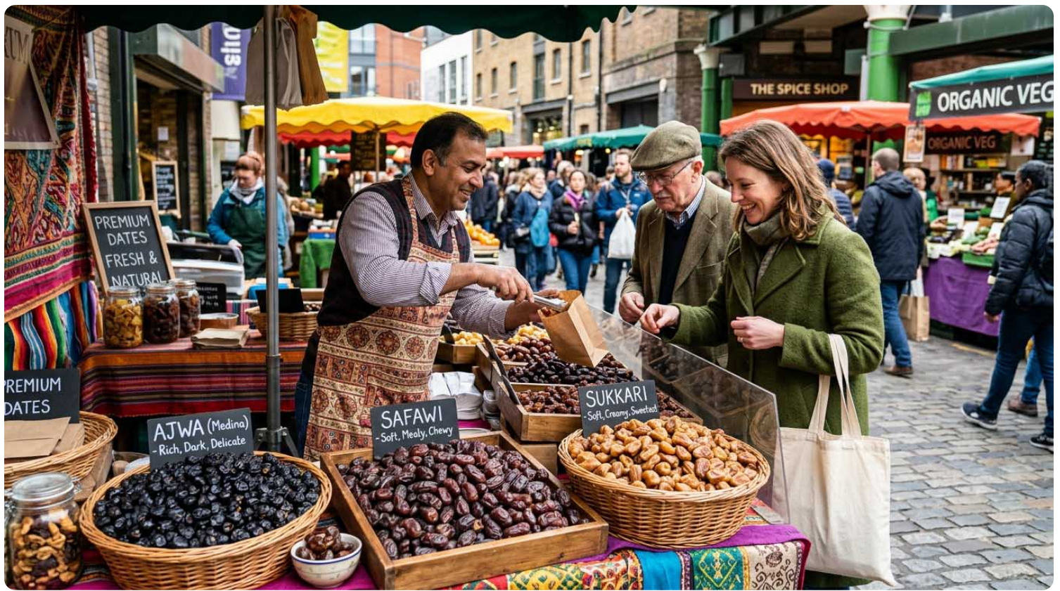
madinah dates market souq al tamr ajwa safawi sukkari dates

Practical Info: 10-minute walk from Masjid Nabawi. Prices: 50-150 SAR/kg. Bargain gently. Buy vacuum-sealed boxes for UK travel. UK tip: Buy Ajwa for Sunnah, Sukkari for children. Buy dates on your last day — they're heavy. For luggage tips, see our Umrah packing list .