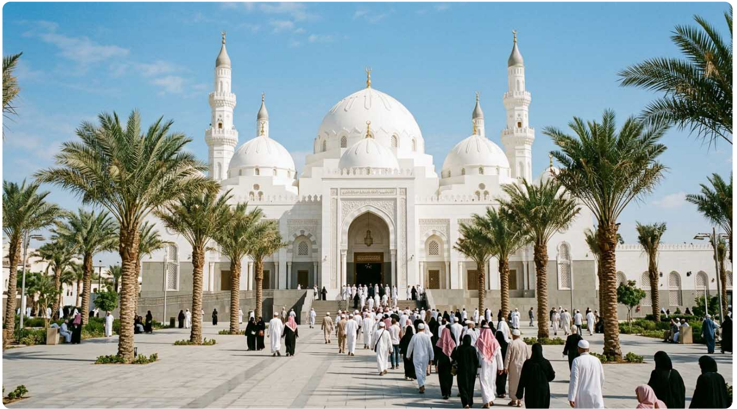
masjid quba first mosque in islam madinah after renovation

UK tip: Go on Saturday morning — following the Prophet’s Sunnah. And if you want to learn more about Umrah, read our step-by-step Umrah guide .