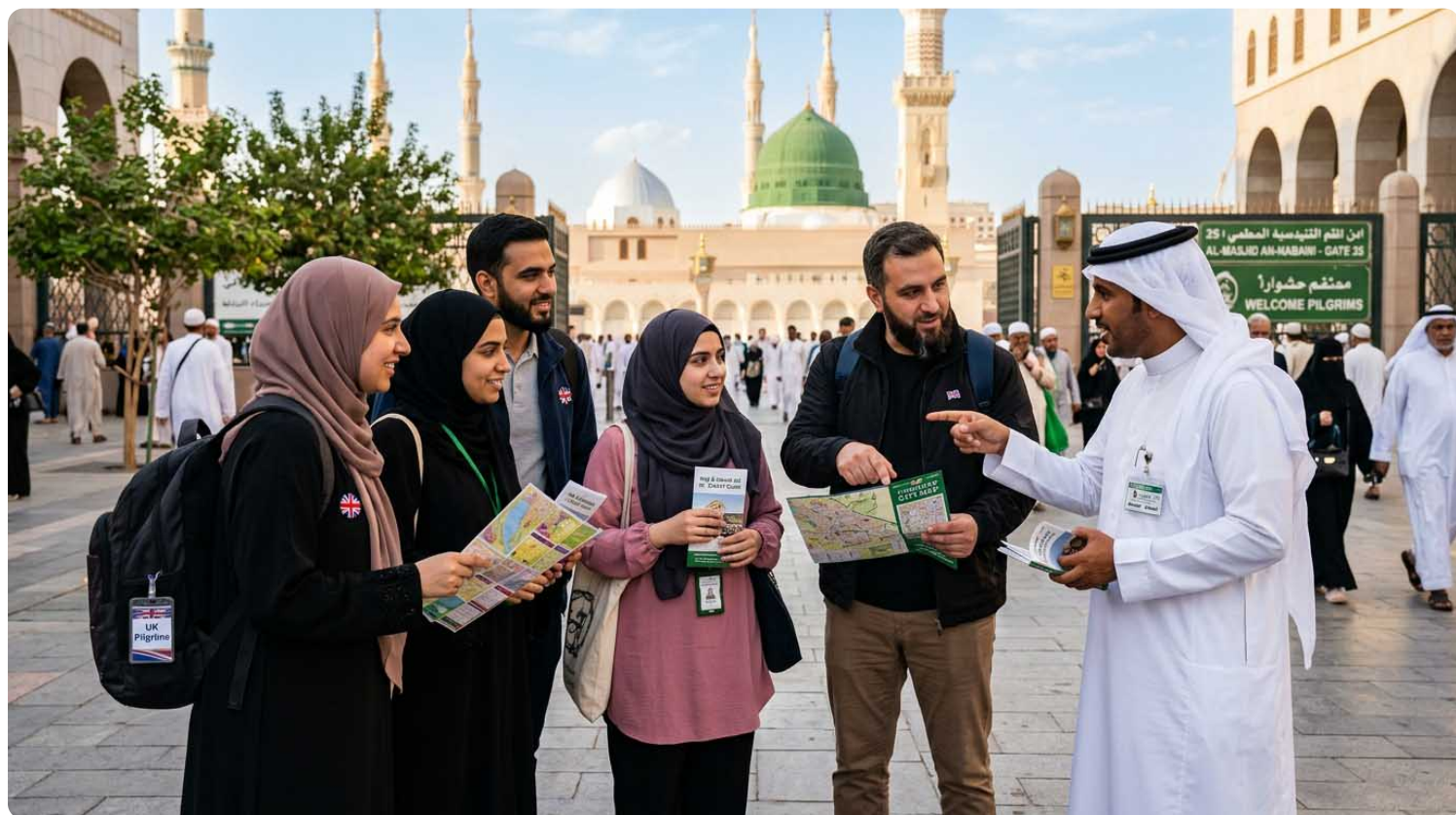
uk muslim pilgrims in madinah asking questions guidance