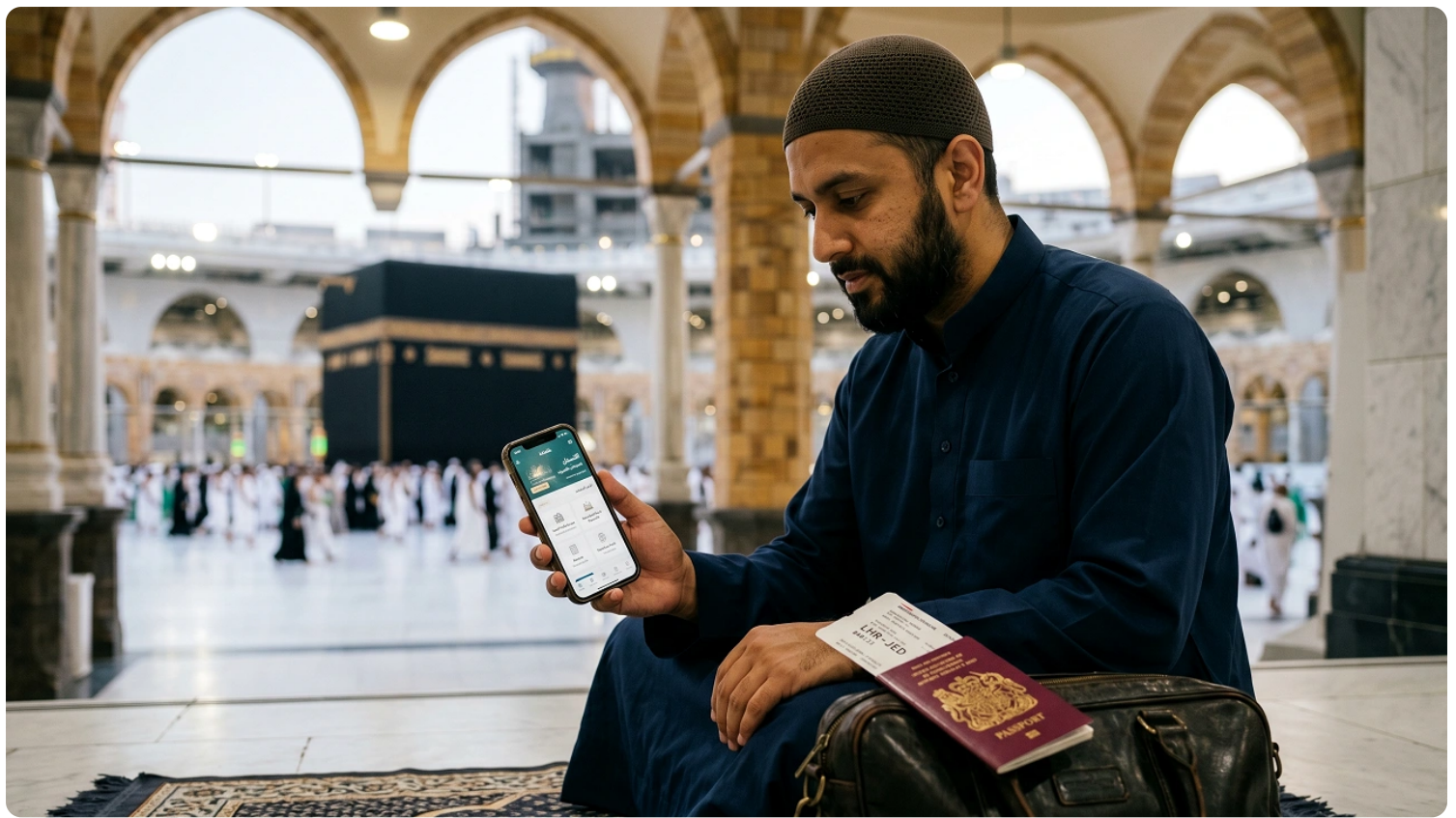
Nusuk App Guide UK Pilgrims Umrah Registration on Smartphone with Kaaba Background