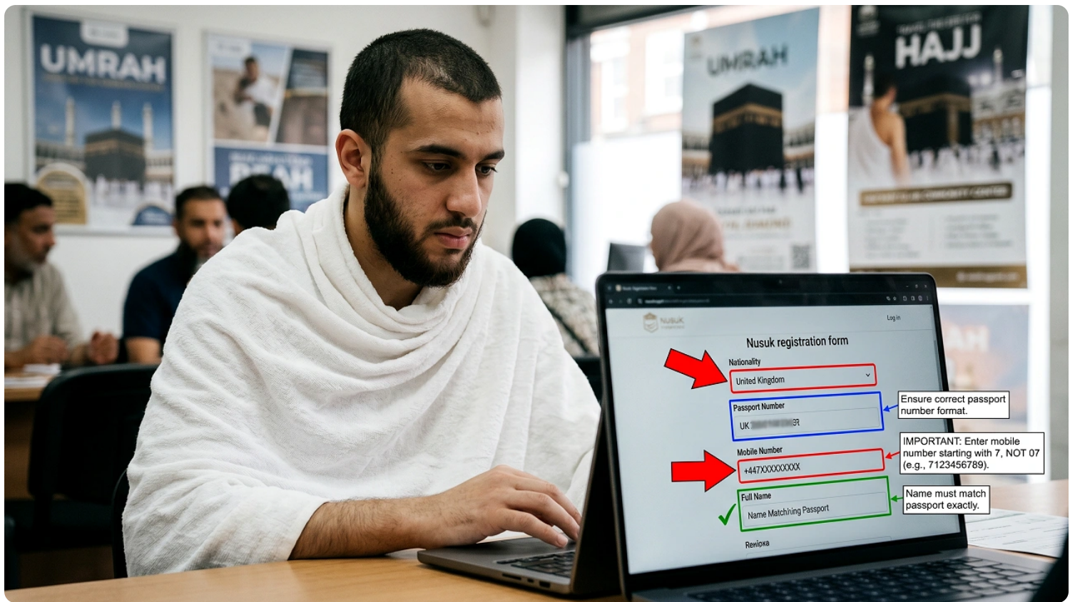
Nusuk App Registration UK Passport Details with Phone Number Format and Passport Fields Highlighted