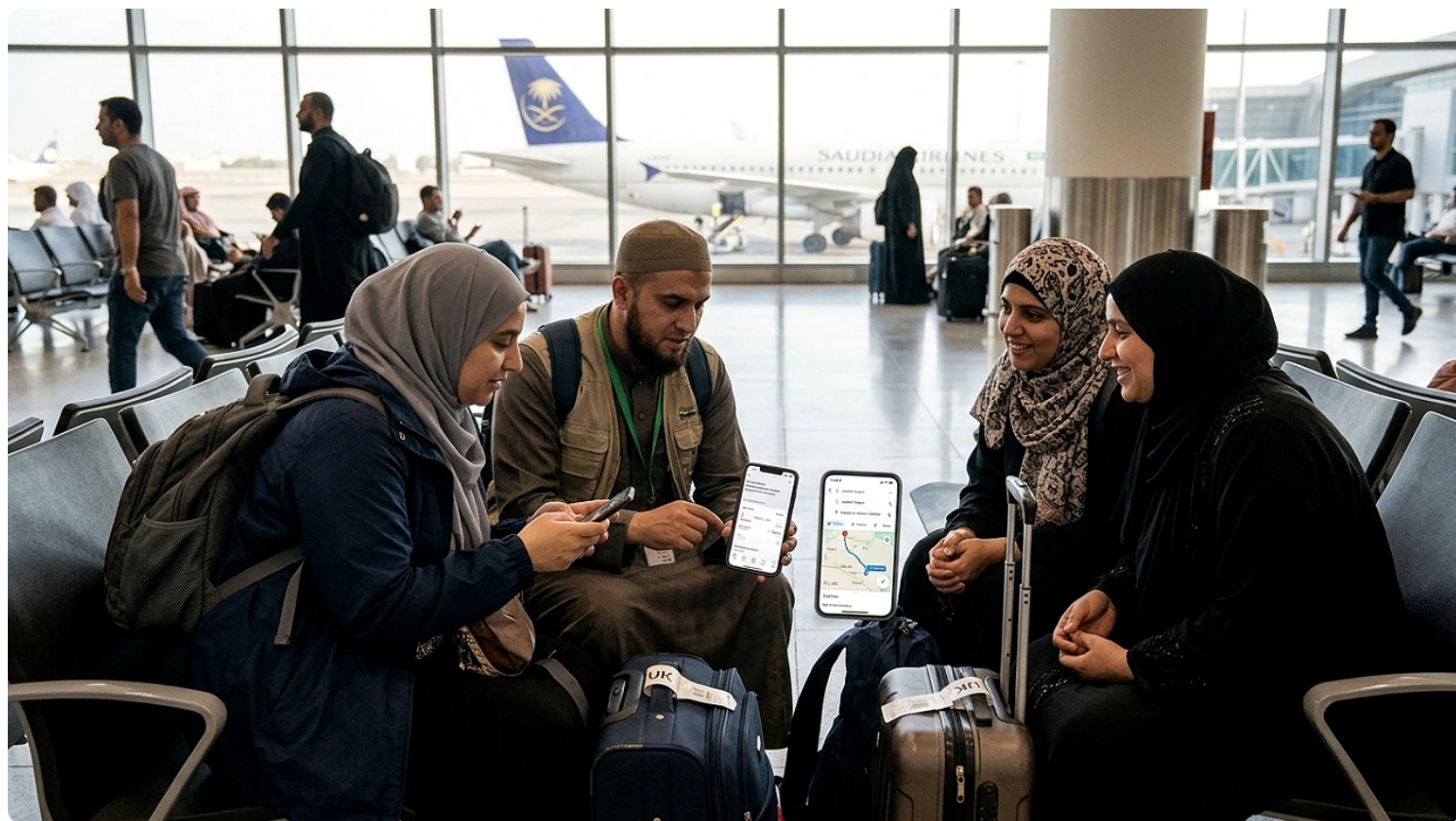
UK Umrah Pilgrims Reviewing Jeddah Airport to Makkah Travel Questions on Mobile Phones