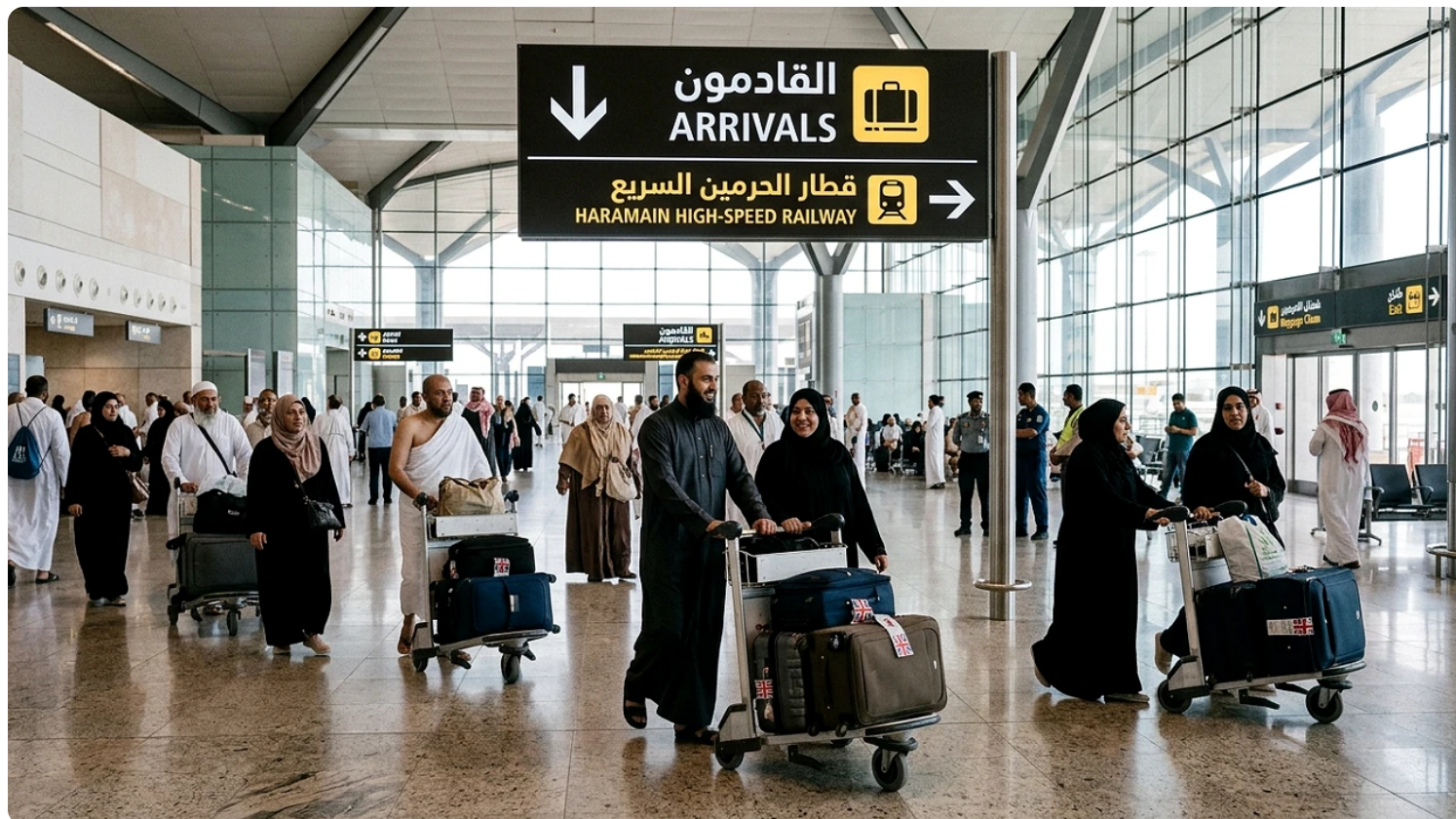
Jeddah Airport to Makkah Transport Guide for Umrah Pilgrims in Terminal Arrivals

First trip? Don't panic. We've done this hundreds of times. You're going to be fine, insha'Allah.