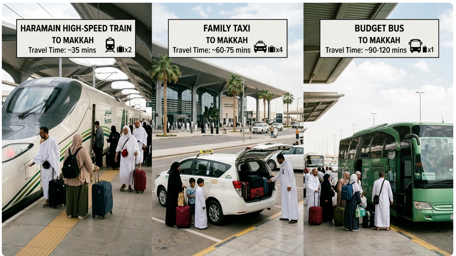
Jeddah Airport to Makkah Transport Options Train Taxi and Bus Comparison

And if you're still comparing trip styles, you can also browse our Umrah packages , 3 star Umrah packages , 4 star Umrah packages , and 10 days 4 star Umrah package . Different packages suit different arrival plans.