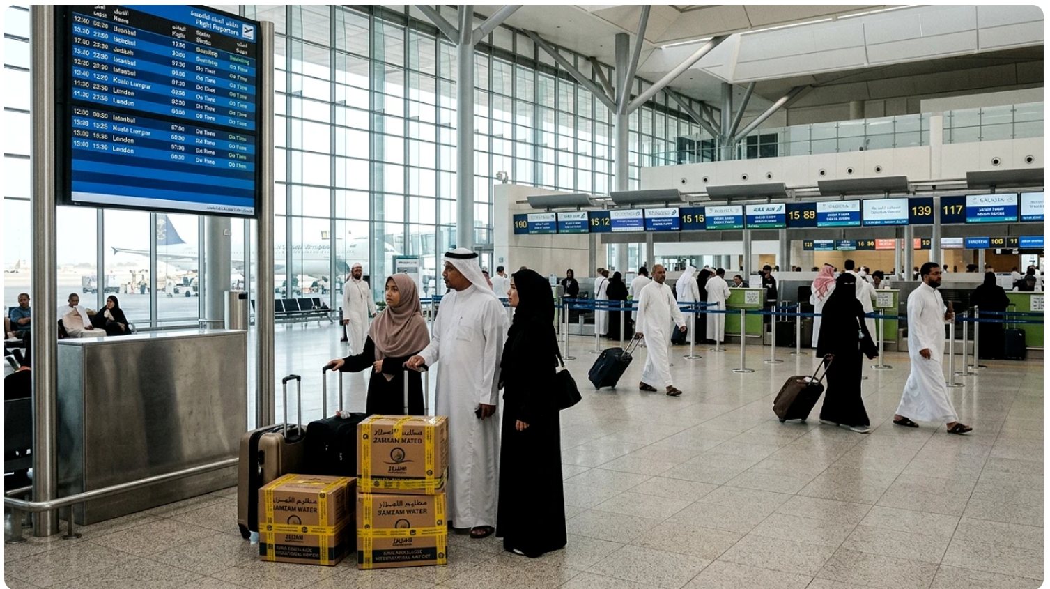
Jeddah Airport Departure Hall with Umrah Pilgrims Checking Flight Times