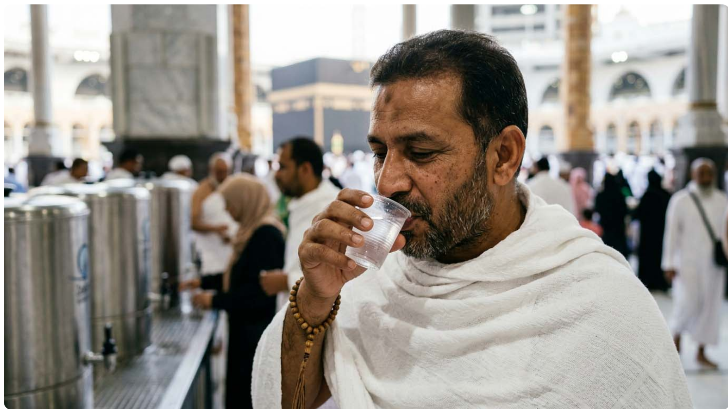
drinking zamzam water after tawaf during umrah pilgrimage