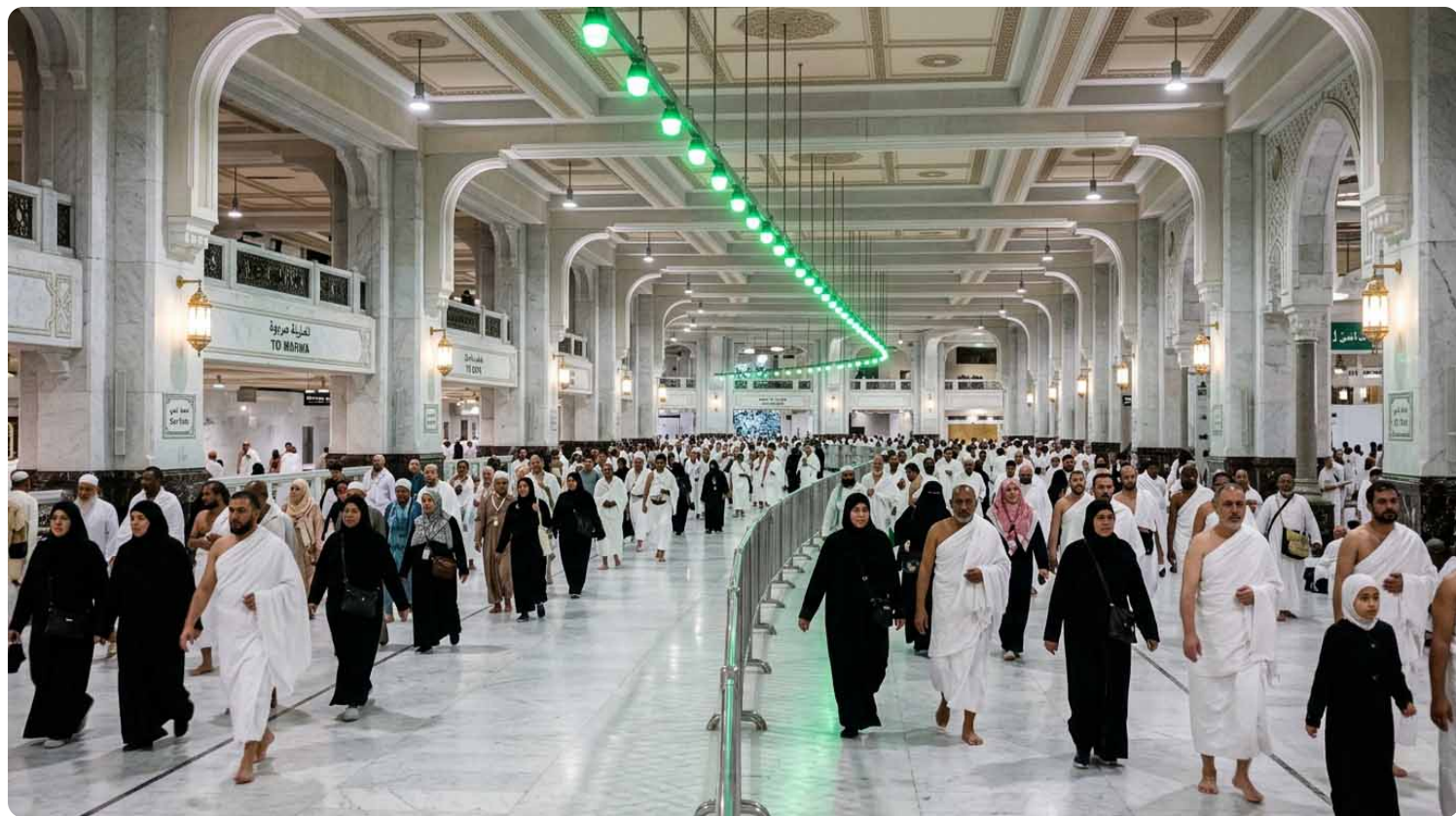
sai between safa and marwah during umrah step by step guide