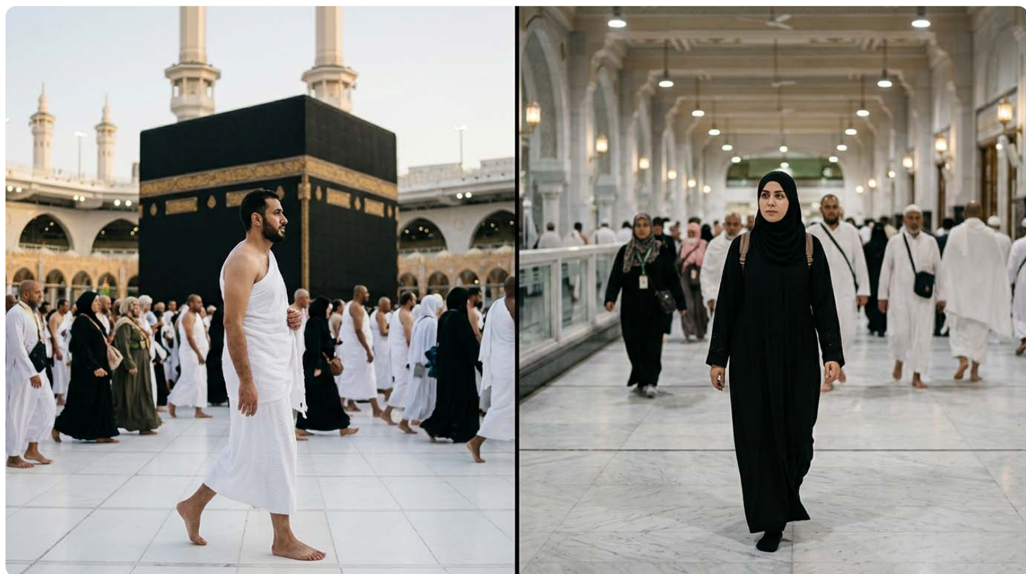
umrah rules comparison men vs women ihram tawaf sai differences

There are key differences between how men and women perform Umrah. Here's a handy table for quick reference: