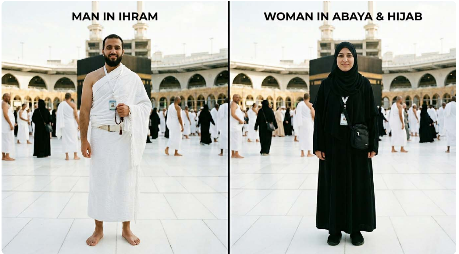
ihram clothing for umrah men two white sheets women modest dress

If you break a rule by accident, you may need to offer fidyah (compensation). Ask your group leader or a scholar for advice.