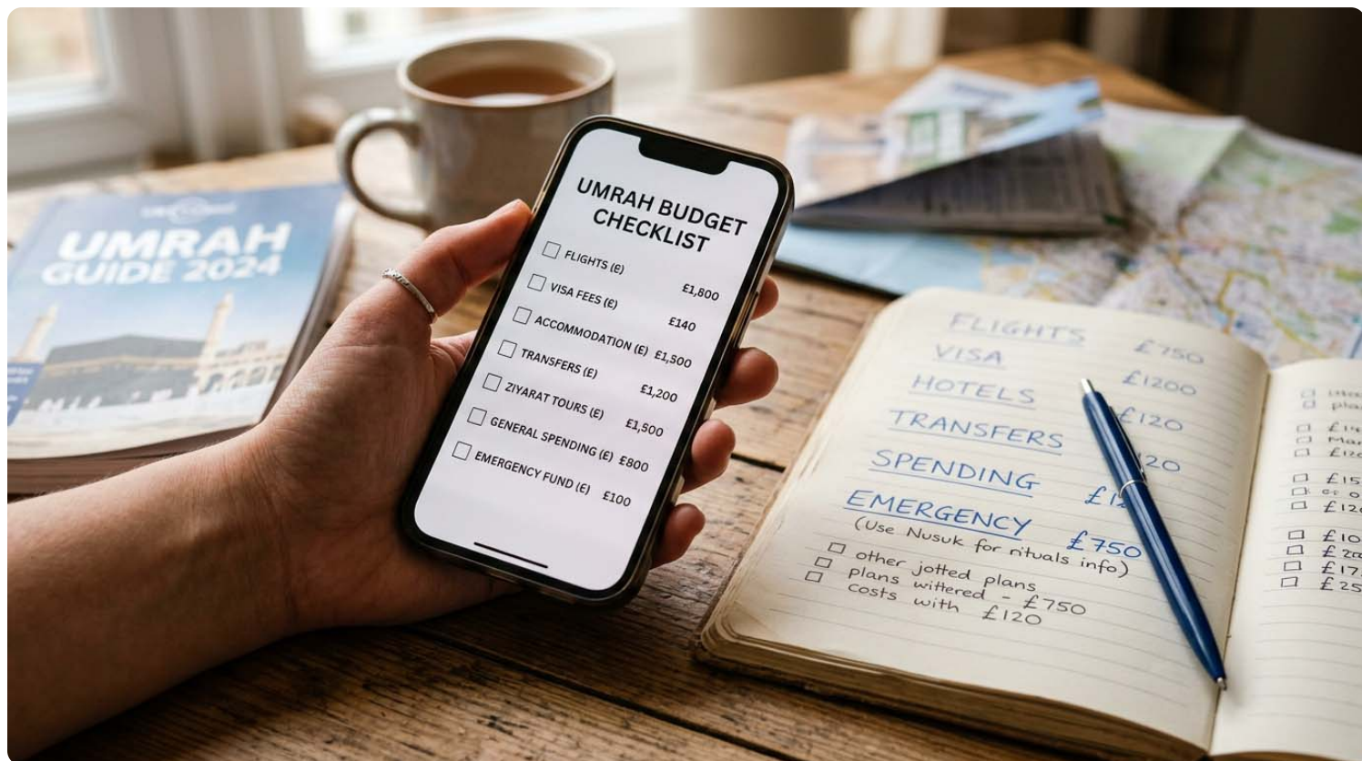
how much does Umrah cost from UK budgeting checklist on a phone with Nusuk app and notes

Good question. Knowing the steps removes stress. It also helps you make the most of your time in Makkah and Madinah. We recommend reading how to perform Umrah before you fly.