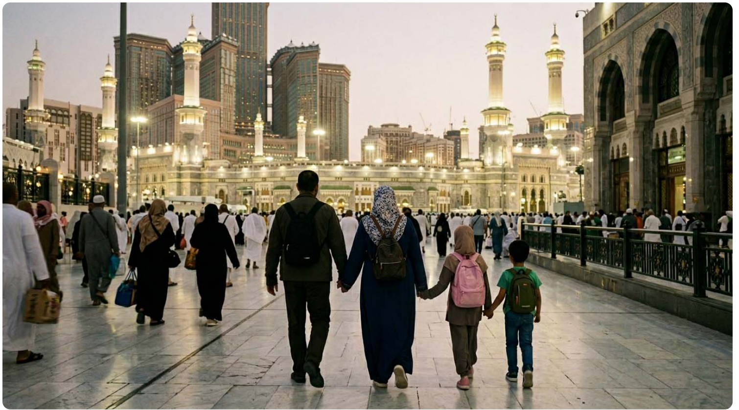
Umrah cost for family of 4 from UK with parents and children walking near Masjid al-Haram