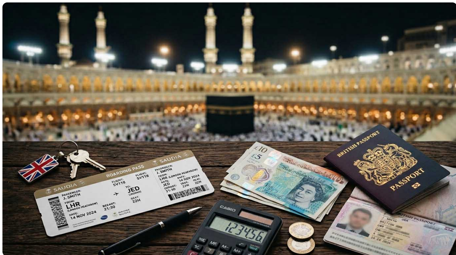
how much does Umrah cost from UK shown with GBP notes, a British passport, and a Kaaba backdrop

If you'd like help matching dates to a budget, you can View our current Umrah package prices . No pressure. It just helps you see live options.