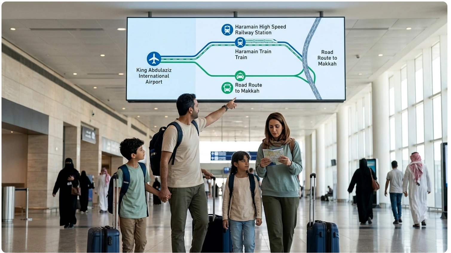
Jeddah Airport to Makkah Transport Options Route

And if you're flying into Jeddah but heading to Madinah first, the train is the clear winner again.