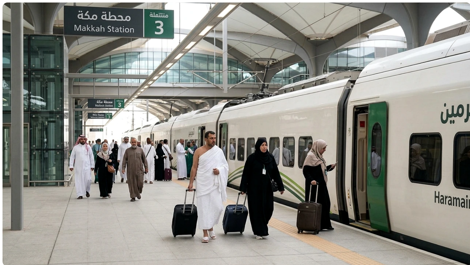
Haramain High Speed Railway Makkah to Madinah Train at Modern Saudi Station

sense. If you're still sorting the wider trip, you can also look at our Umrah packages or read our guide on how to perform Umrah step by step .