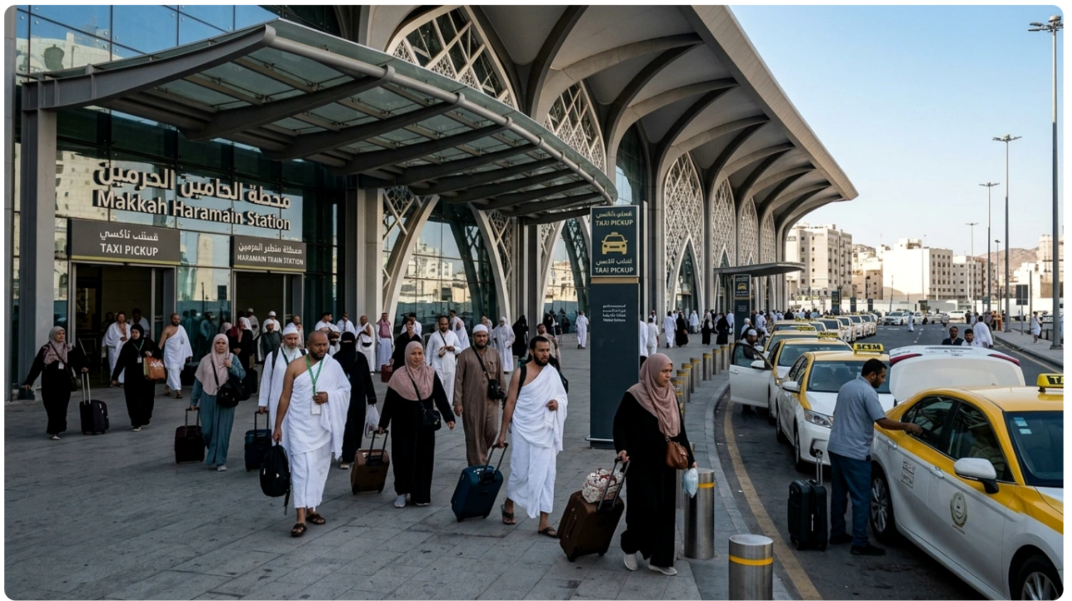
Makkah Train Station Haramain Railway with Taxi Pickup Area