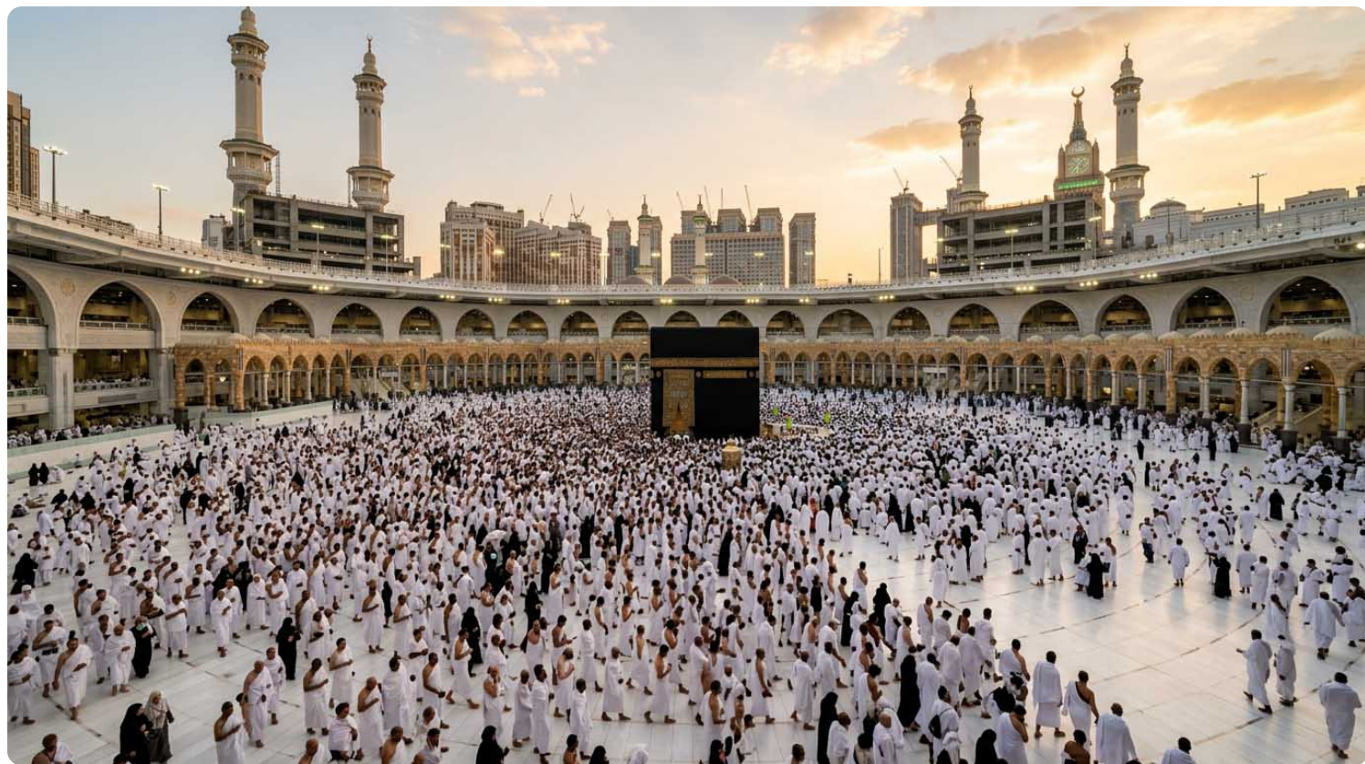
dua for tawaf complete guide pilgrims performing tawaf around kaaba 2026