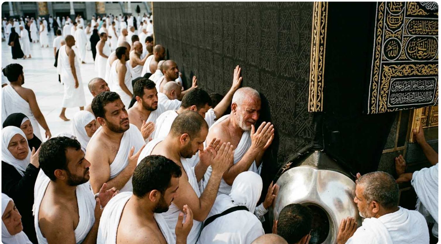
dua at multazam kaaba where duas are answered during tawaf

The Multazam is the area between the Black Stone and the door of the Kaaba. It's a powerful place for dua — many scholars say it's among the best spots on earth to ask Allah for anything. There's no fixed dua here. If you can reach it, press your chest, face, and hands against the wall and pour out your heart. If not, face it from a distance and make your most personal dua. Don't be shy — ask for everything, big or small.