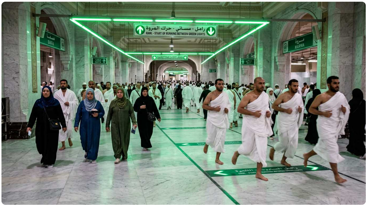
green markers in sai corridor between safa and marwa where men jog

These green lights commemorate Hajar's worry and her extra effort. It's a moving moment. Men, remember: only jog between the green markers. Outside that area, walk normally.