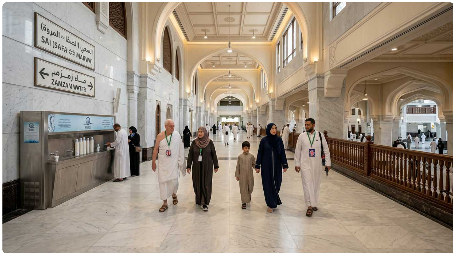
dua for safa and marwa complete sai guide pilgrims walking between safa and marwa 2026