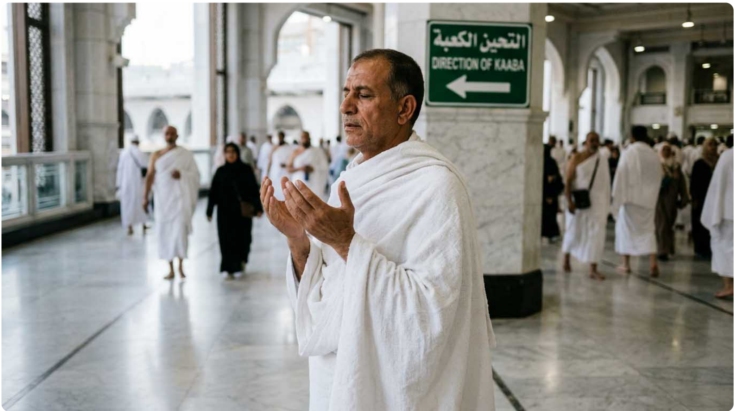
dua at safa pilgrim raising hands making dua facing kaaba during sai

Want to know more about Zamzam and its miracles? Read our Zamzam water guide.