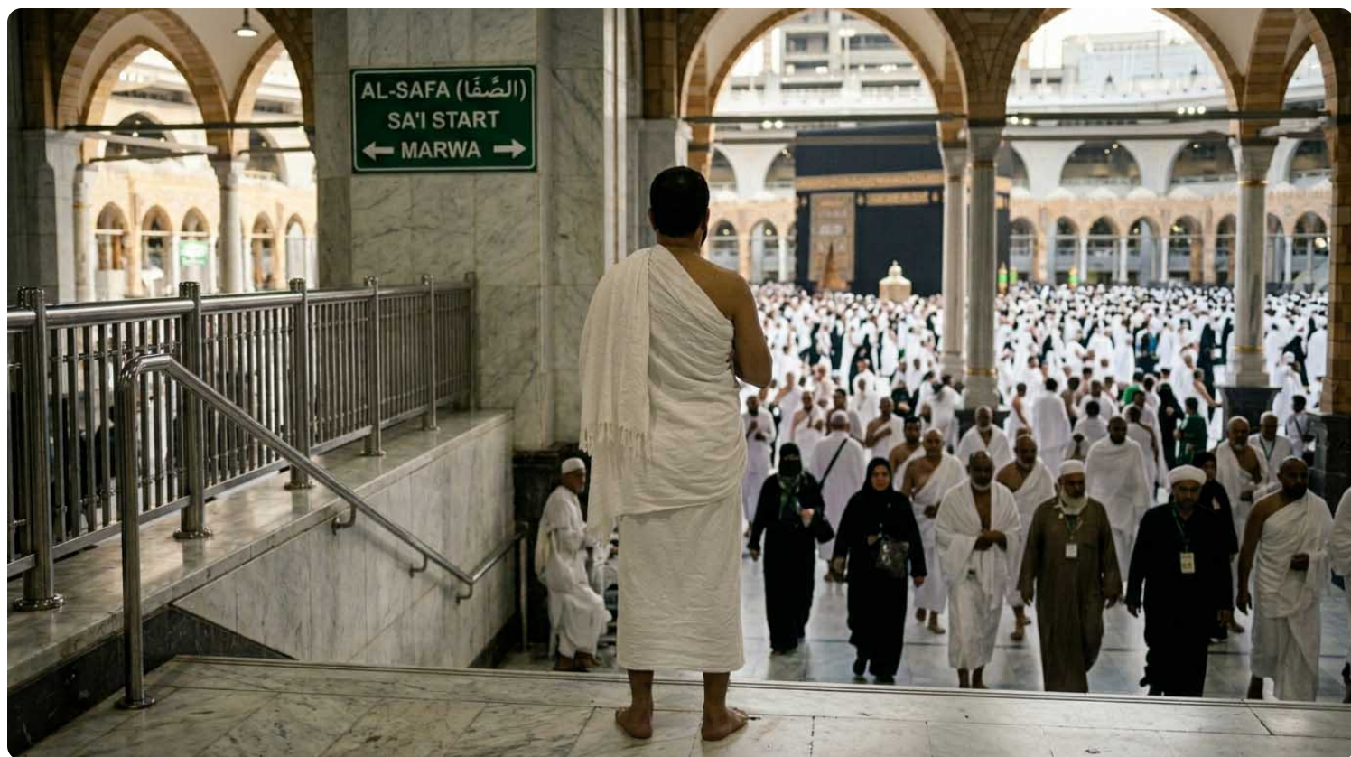
dua at safa pilgrim raising hands making dua facing kaaba during sai