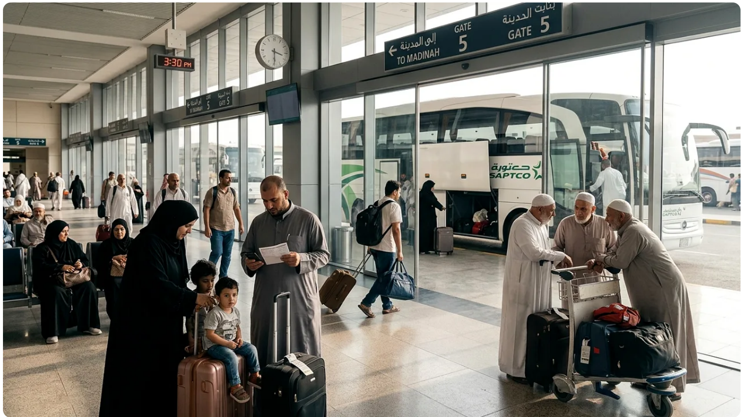
Makkah weather by month temperature guide with thermometer icons and seasonal colours

Also, keep an eye on Hajj timing. Umrah isn't allowed during the Hajj days. We'll cover that below.