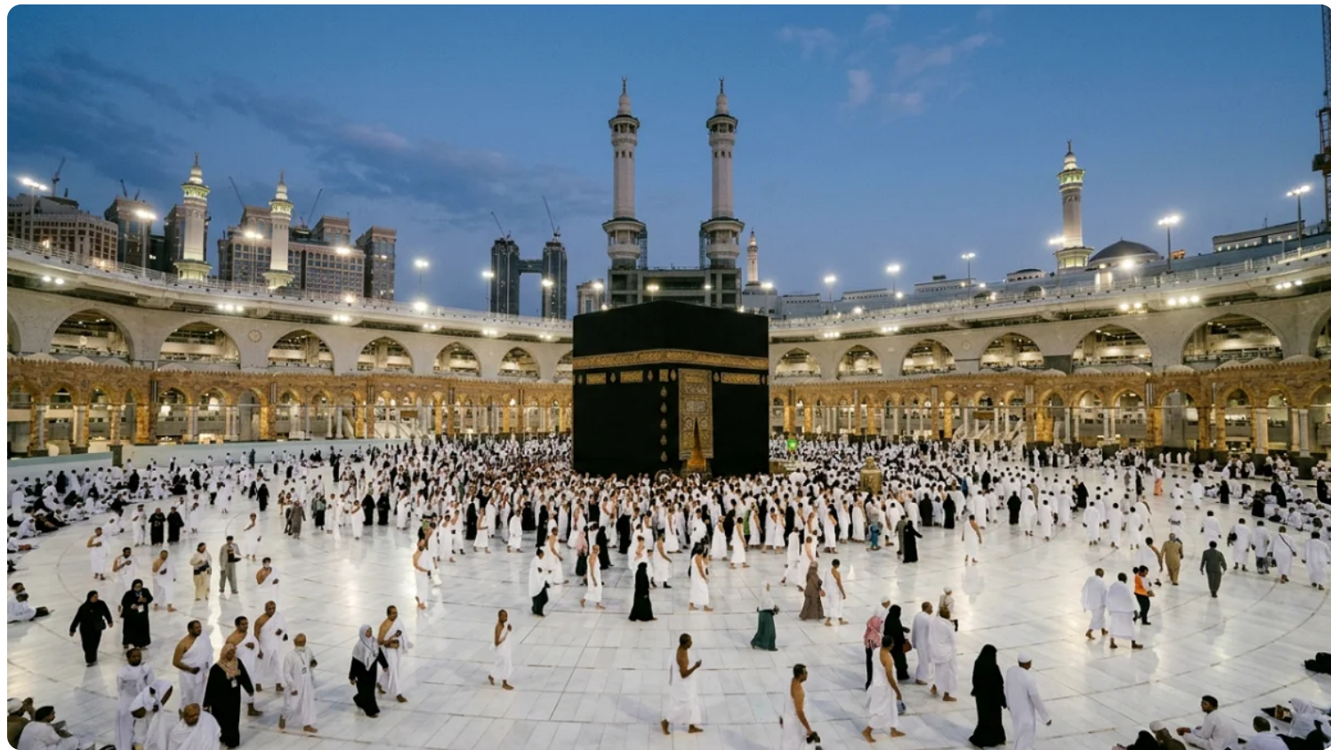
best time to perform Umrah month by month guide with Kaaba and a 12-month calendar overlay

And if you're comparing seasons and hidden costs, our team put it all in one place here: how much Umrah costs by season .