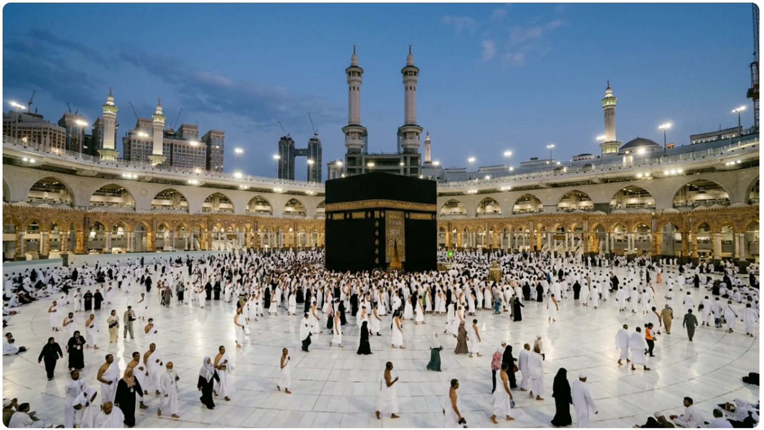
best time to perform Umrah month by month guide with Kaaba and a 12-month calendar overlay