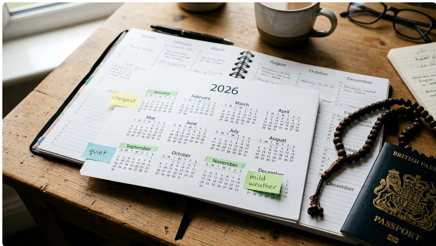
Cheapest months for Umrah from UK shown on a planner with January September November highlighted

If you want the full breakdown of what's included (and what catches people out), read: full Umrah cost breakdown .