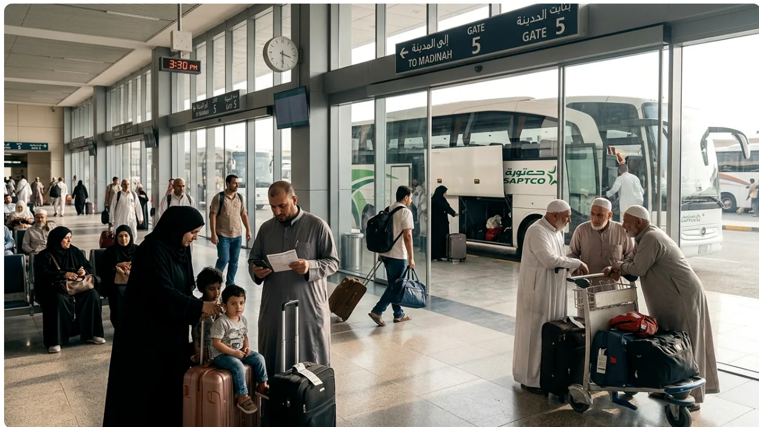
Makkah weather by month temperature guide with thermometer icons and seasonal colours