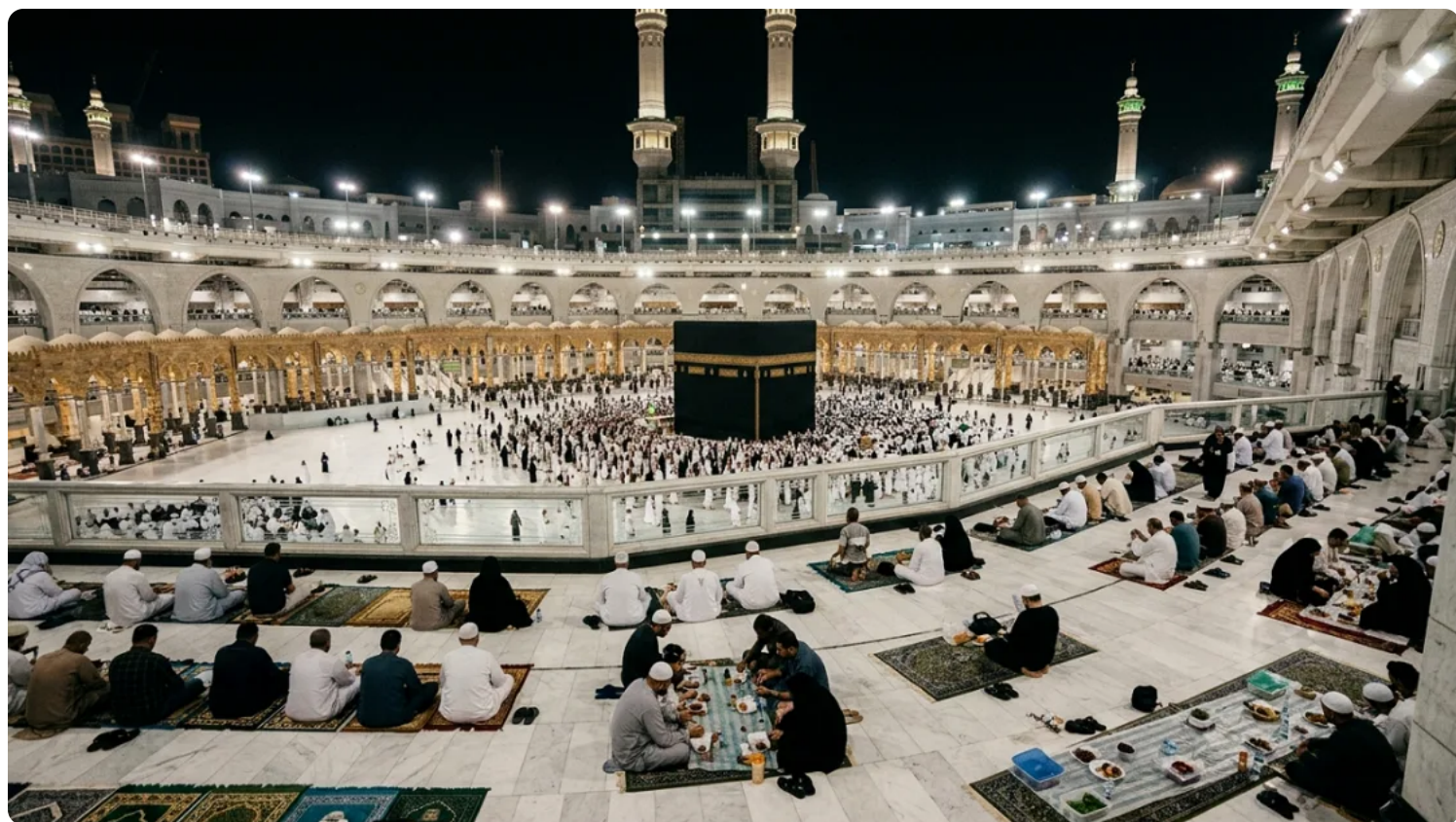
Umrah in Ramadan Haram atmosphere at night with lights and worshippers