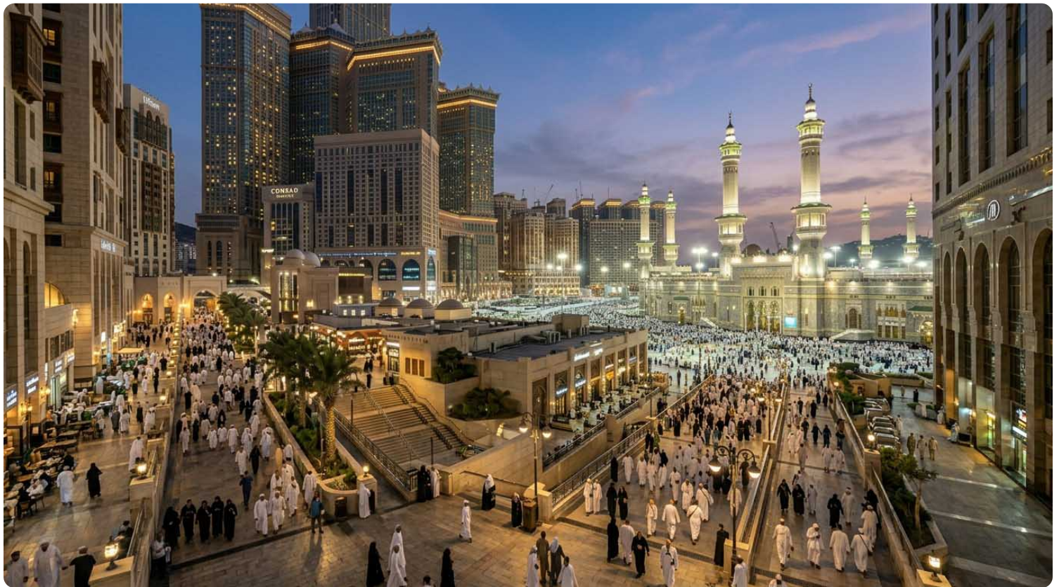
Jabal Omar hotels Makkah Conrad Hyatt Hilton Suites

Price: £50-£100 per night . Elaf Kinda Hotel Makkah can be a good budget 4-star. But remember our Ajjad warning. It can be steep on the way back. If you're fit, it's fine. If not, it's a struggle.