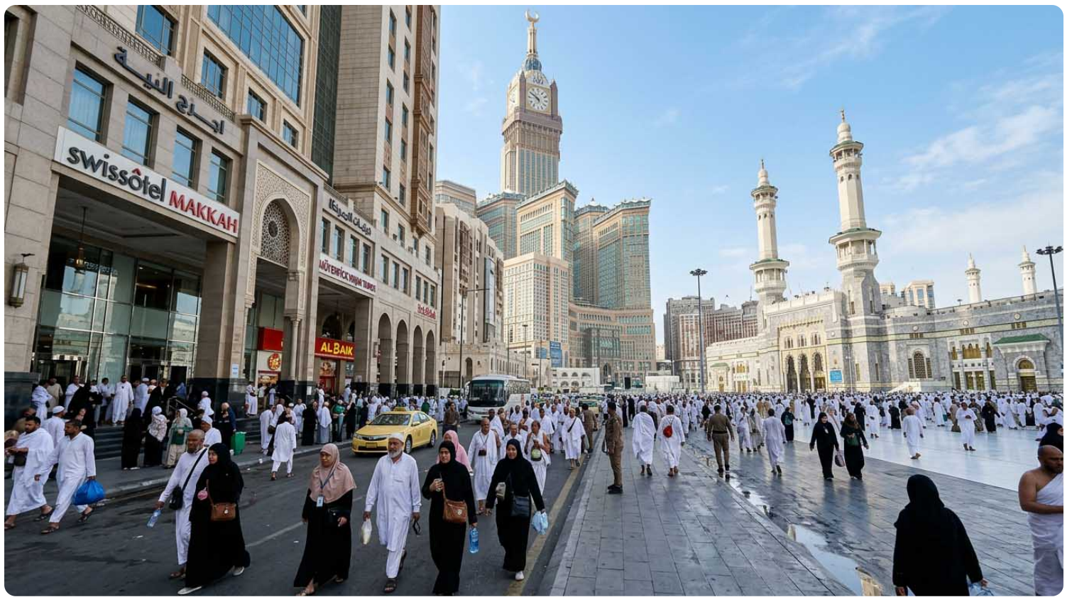
Abraj Al Bait Clock Tower hotels Makkah Swissotel Pullman Fairmont