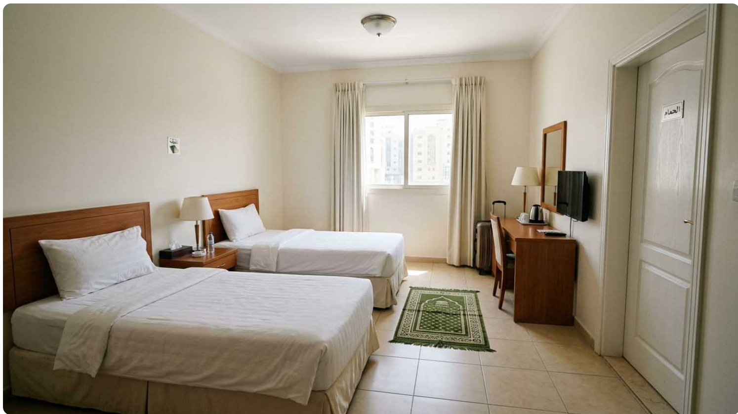
Budget 3 star hotel room near Haram Makkah