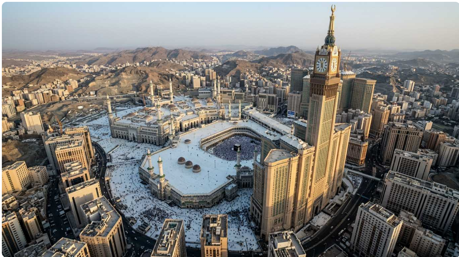
Hotels near Haram Makkah aerial view for Umrah pilgrims

If you'd like us to match these hotels to your dates and budget, you can View our Umrah packages with these hotels . No pressure. It just saves you time.