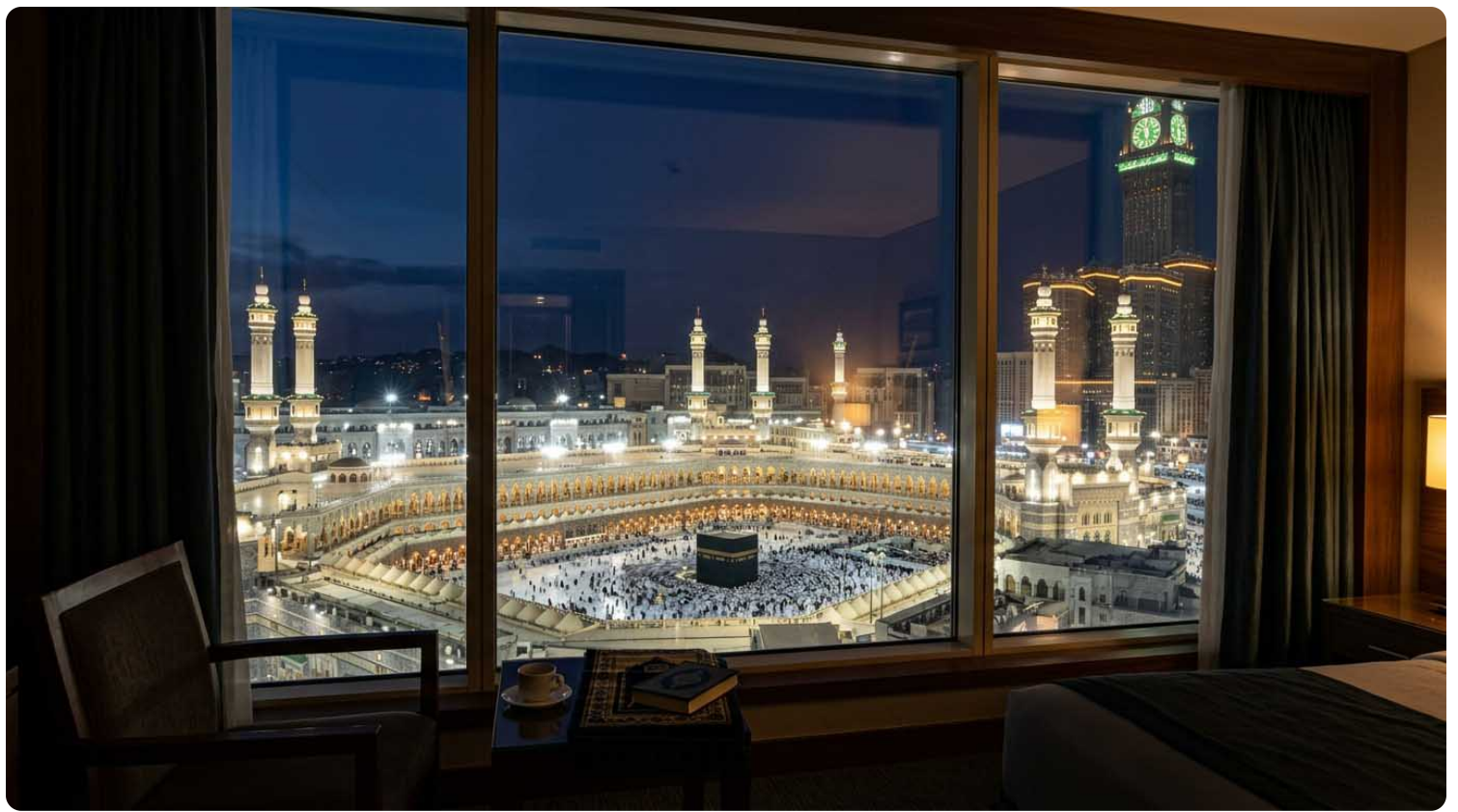
Hotel room with Kaaba view Makkah